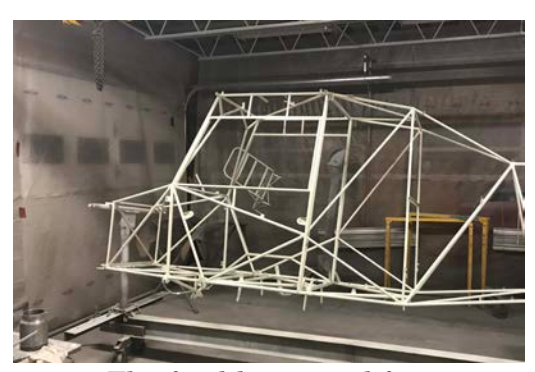
The freshly painted fuse.