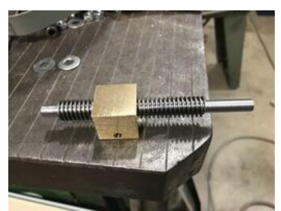
This is the jack screw for the adjustable seat

The work continues. Here are some recent photos: