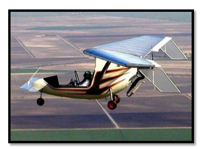
The photo is an example of the airplane that is for sale.

For sale by third owner family. Falcon Ultralight plus trailer. Last flown in the year 2000. Only sold as complete parts plane. $4,500.00. Always hangared or garaged. Ballistic parachute. Custom windscreen cover. UP kit for rudders. NEVER DAMAGED.