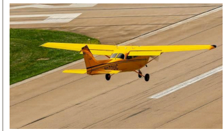
LAST 300 FEET