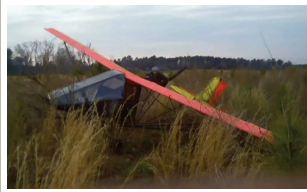
ENGINE FAILURES HAPPEN