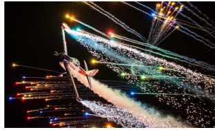
COUNTDOWN TO SUN'N'FUN

“EXPERIENCE IS WHAT YOU GET RIGHT AFTER YOU NEEDED IT”