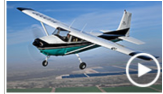
AOPA SWEEPS WINNER