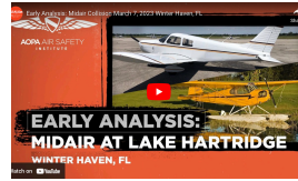
MIDAIR COLLISION AOPA EARLY ANALYSIS