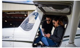
EAA LEARN TO FLY WEEK

"GET YOUR KIDS HOOKED ON AVIATION, THEY WON'T HAVE MONEY FOR DRUGS AND ALCOHOL"