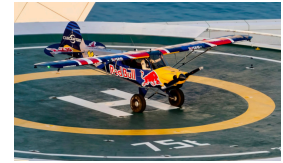
STOL ON A HELICOPTER PAD