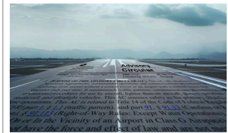
FAA UPDATES AC FOR PROCEDURES AT NON-TOWERED AIRPORTS