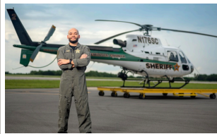
FROM PATROL CAR TO AIRBUS H125 COMMAND