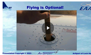
HOW TO GROUND AN AIRPLANE

FAA MOTTO: "WE'RE NOT HAPPY, TILL YOU'RE NOT HAPPY".