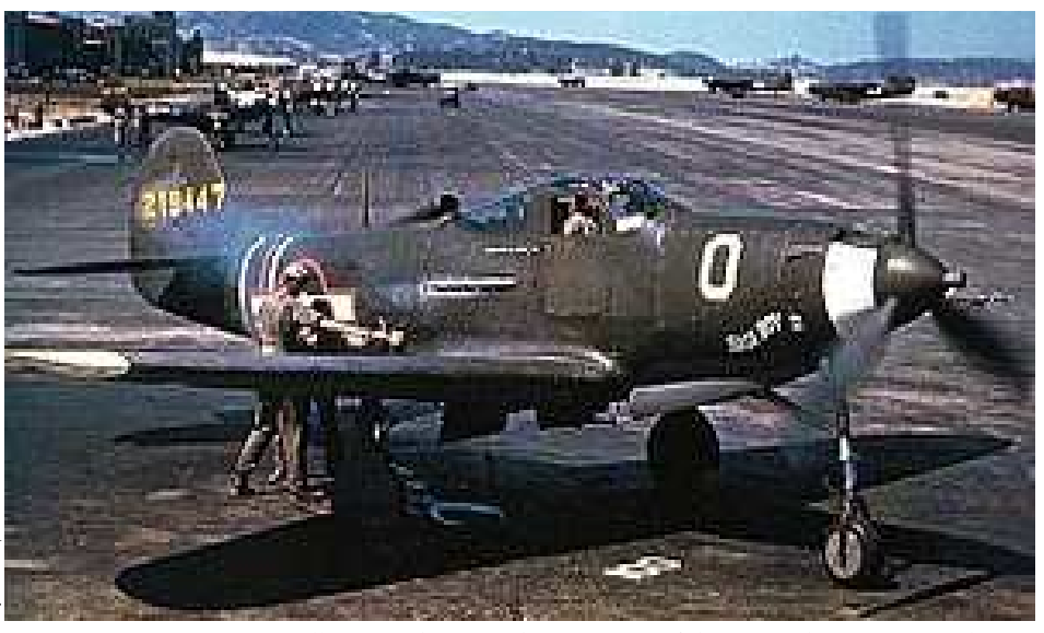
Bell XP-39 showing the position of the supercharger air intake