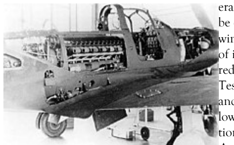
Bell P-39 Airacobra center fuselage detail with maintenance panels open

As originally specified by Kelsey and Saville, the XP-39 had a turbosupercharger to augment its high-altitude performance. Bell cooled the turbo with a scoop on the left side of the fuselage. Kelsey wished to shepherd the XP-39 through its early engineering teething troubles, but he was ordered to England. The XP-39 project was handed over to others, and in June 1939 the prototype was ordered by Gen-