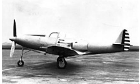
Bell XP-39 showing the position of the supercharger air intake

A secondary benefit of the mid-engine arrangement was that it created a smooth and streamlined nose profile. Much was made of the fact that this resulted in a configuration "with as trim and clean a fuselage nose as the snout of a high velocity bullet". Entry to the cock-