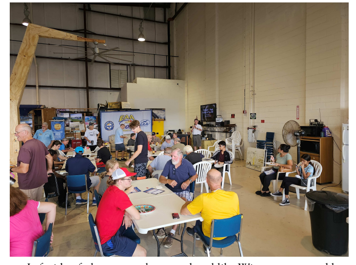
Left side of photo note the pterodactyl like Wingasoar created by Henry for the amazement and cooling of attendees