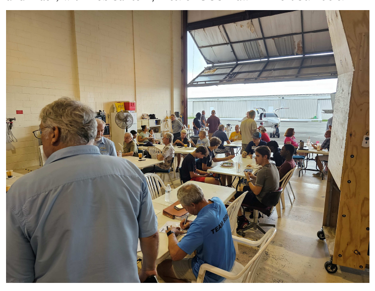
Great breakfast with a terrific presentation by CGS Hawk President