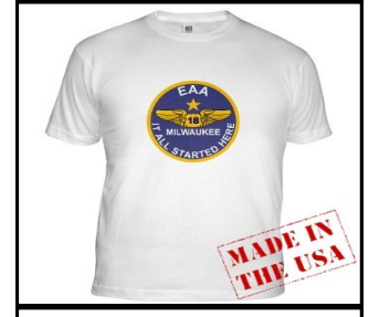
Chapter 18 Apparel is on sale now. T-Shirts, Hats, Coffee Mugs, and much, much more. Order anytime and no minimums. Each purchase will help to support the chapter.