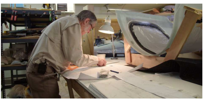
Burt Rutan working in his garage on his latest design, the SkiGull.

March 12, 2015 – Details are beginning to surface regarding the airplane Burt Rutan is creating, an aircraft mentioned in a recent EAA story about a documentary currently being produced about the iconic aircraft designer. It's called the SkiGull and is being described, according to documentary producer antennaFILMS, as a motor glider that can land on a variety of surfaces (water, snow, unimproved land, etc.) allowing access to remote areas like never before.