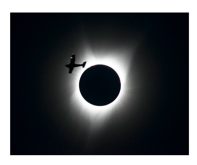
PAGE EIGHT | FLYPAPER

Positioned within the eclipse path, KEHR is another option for Chapter pilots to consider for witnessing this celestial event.