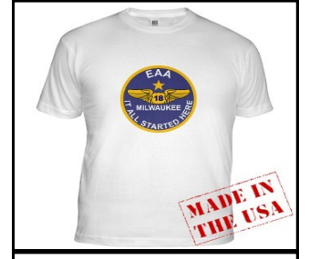
Chapter 18 Apparel is on sale now. T-Shirts, Hats, Coffee Mugs, and much, much more. Order anytime and no minimums. Each purchase will help to support the chapter.