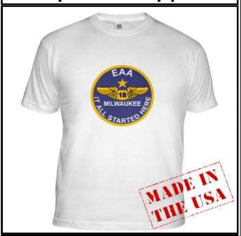
Chapter 18 Apparel is on sale now. T-Shirts, Hats, Coffee Mugs, and much, much more. Order anytime and no minimums. Each purchase will help to support the chapter.