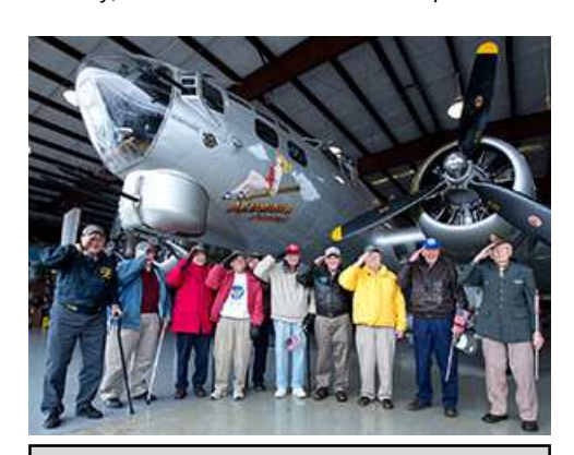
B-17-Vets – Ten World War II United States Army Air Corps veterans representing all 10 Flying Fortress crew positions were given a special flight in EAA's Aluminum Overcast April 14

EAA's Boeing B-17G Aluminum Overcast has made many memorable flights throughout the country, but one would be hard-pressed to