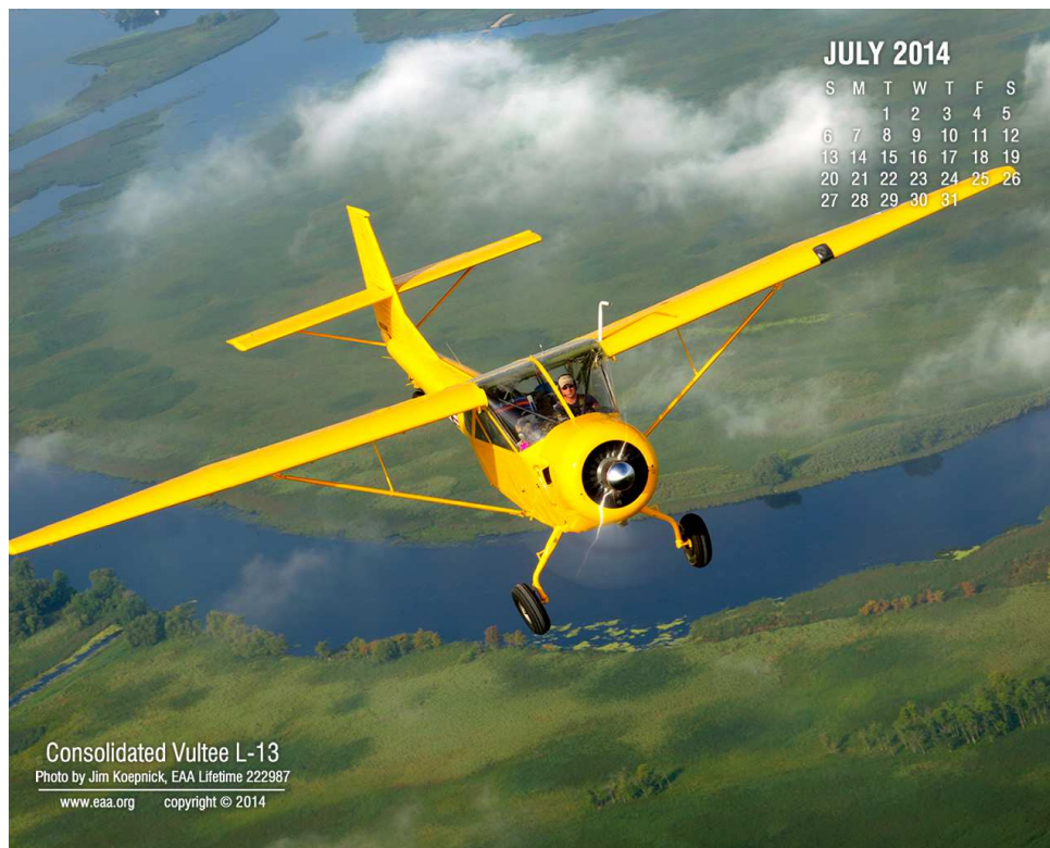
Consolidated Vultee L-13