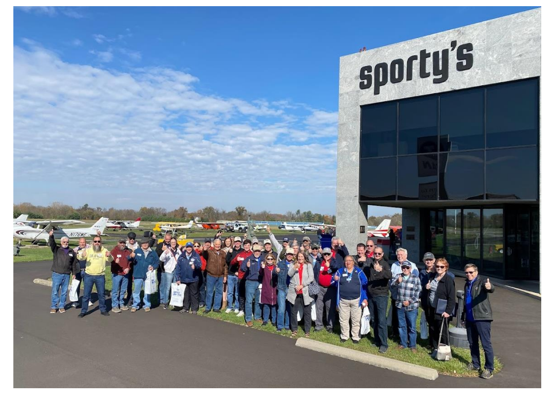
Boot camps are a way of reconnecting with old friends while making new friends.