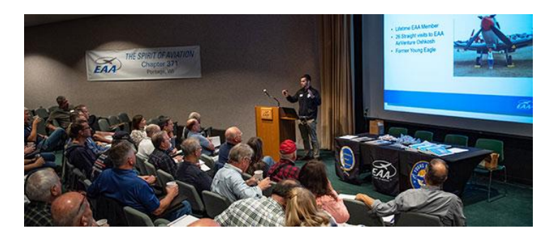
January 27-28, 2024 | Oshkosh, WI

Registration is now open for the two-day interactive EAA Chapter Leadership Academy training session at EAA Headquarters in Oshkosh, Wisconsin, January 27-28, 2024! We'd love to see you there! Seats are limited and registrations are taken first come, first served. This two-day interactive workshop will provide an immersive experience that will help you become a stronger chapter leader!