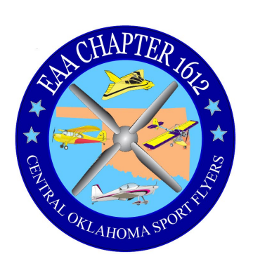
Chapter logo available full-size on shirt back