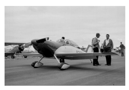
Here is the May 2023 "What is it?"

Max speed on 65 HP was 115 MPH and cruise was 100 MPH.