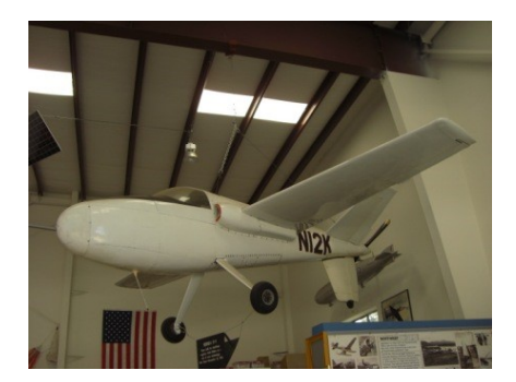
Here is the June 2022 "What is it?"

single-piece aluminum main gear, and constant-chord wings-all are pieces often seen in mass-production aircraft. And yet the airplane is not wholly traditional in appearance—there are the uncommon fuselage contours, rounded at the top and sharply squared at the bottom, and the conspicuously large cabin framed by a prominent hump over the pilots' seats. The CH 2000 has a cruise speed of about 100 knots while burning 6 GPH, a range of 537 SM, and a stall speed of 48 knots clean (44 knots with flaps extended. The original cost in 1996 was $69,000 or $126,436 in 2022 dollars.