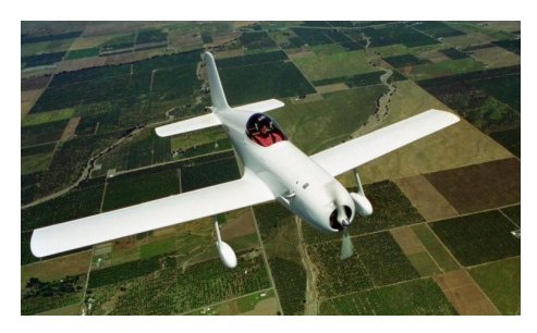
Here is the August 2022 "What is it?"

currently (as of 2007) awaiting restoration at their Gillespie Field annex. According to Aerofiles, two Honey Bees have been built from advertised plans. The aircraft had an empty weight of 550 lbs and a maximum takeoff gross weight of 860 lbs. The aircraft had a wing span of 29 feet and a length of 17 feet. It was powered by the Continental A-65 and had a cruise speed of 105 MPH an a top speed of 120 MPH. Range was approximately 300 miles based on a 1-gallon fuel capacity.