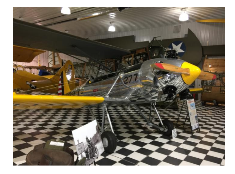
PT22 (the type of aircraft Harrison Ford crash landed on a golf course)