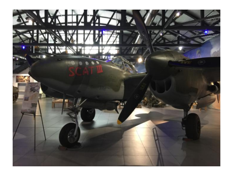
P38 - Scatt III