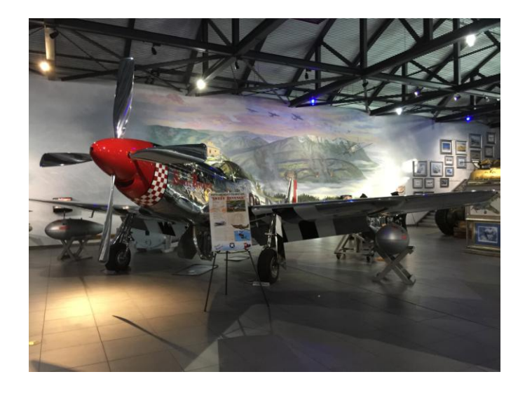
P51D – Sweet Revenge