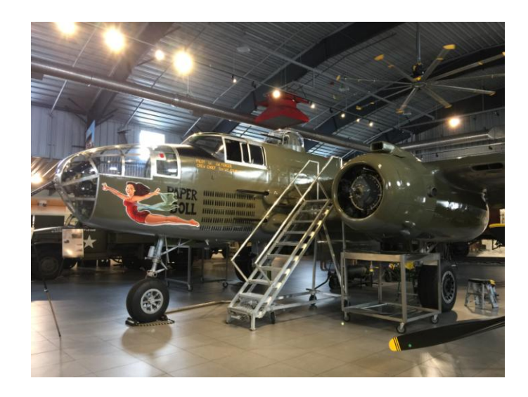
B25 being polished