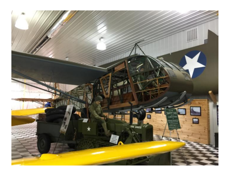
Waco CG-4A Glider