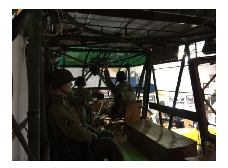
Inside the Waco Glider