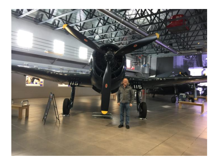
One of the aircraft mechanics said this was a good airport to stop for us on the way to AirVenture.