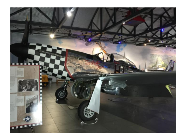
P51D - Twilight Fear