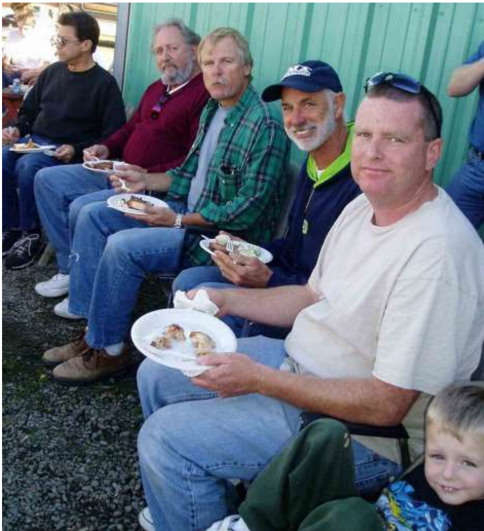
Some of us LFUF guys paying our respects