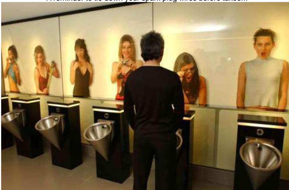
Our new men's room planned for LUF Field