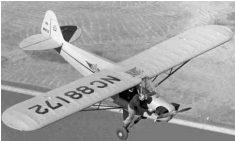
A reminder to tie down your spark plug wires before takeoff!