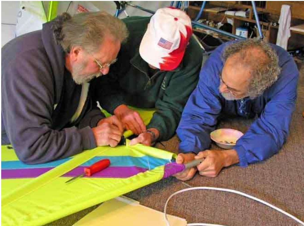
Planning the job

Some pictures of the group trying to work the skins on are shown below.