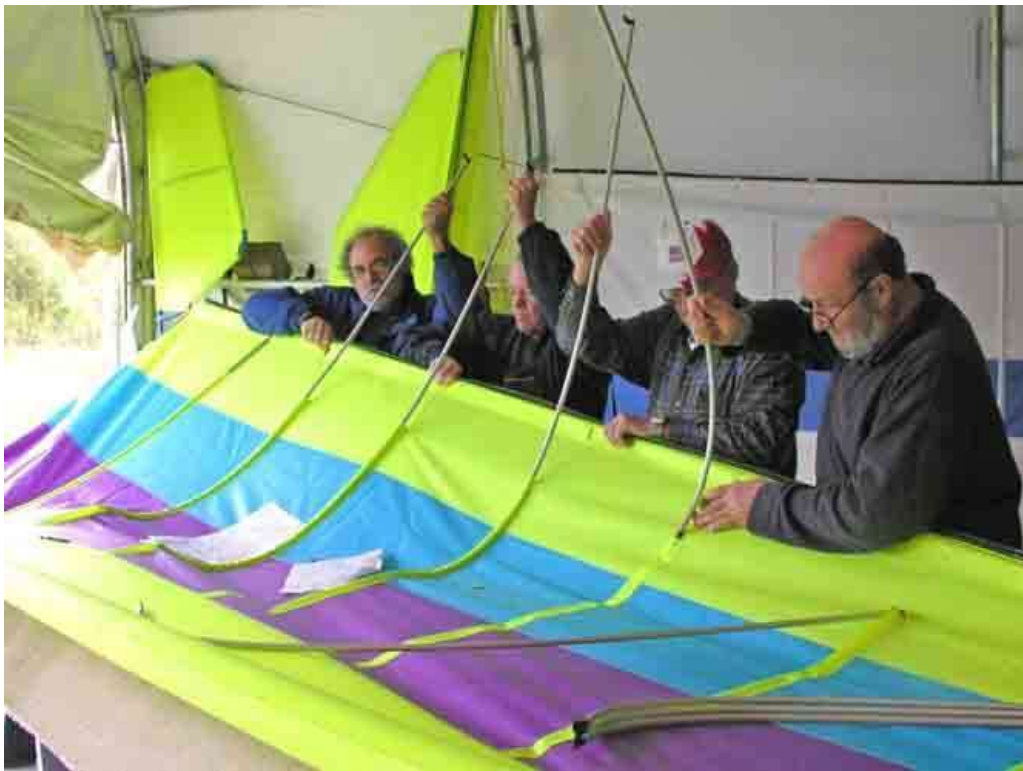
How many LFUF's do you need to screw in a rib?