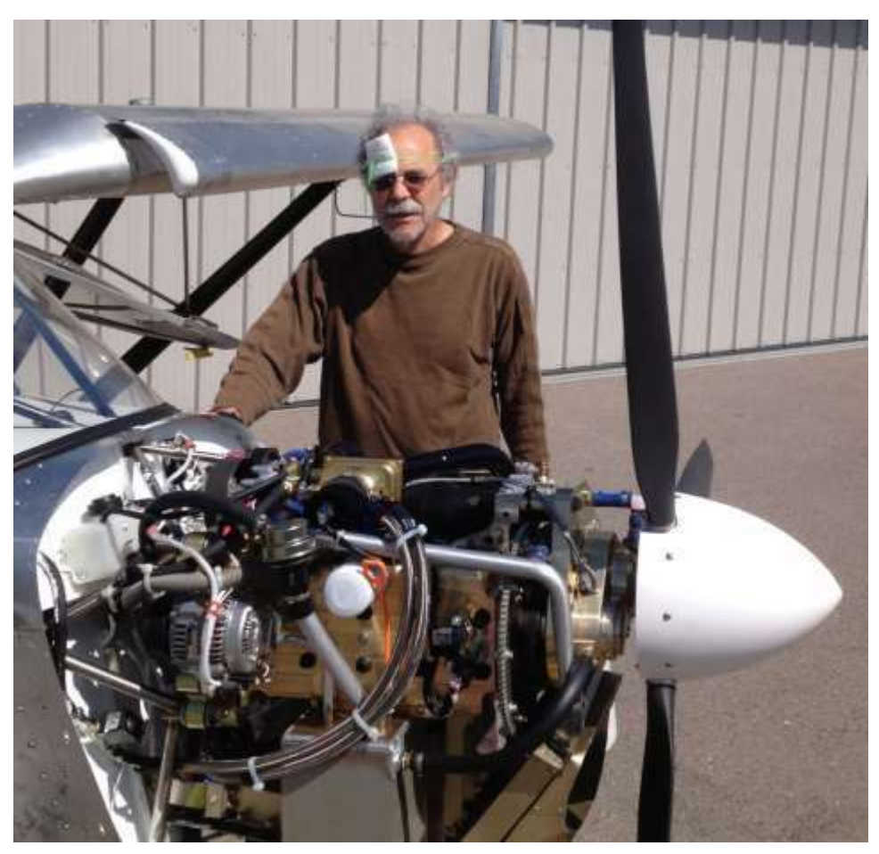
Our fearless leader about to start his new engine after the "new" 701's elevator walked up and hit him.