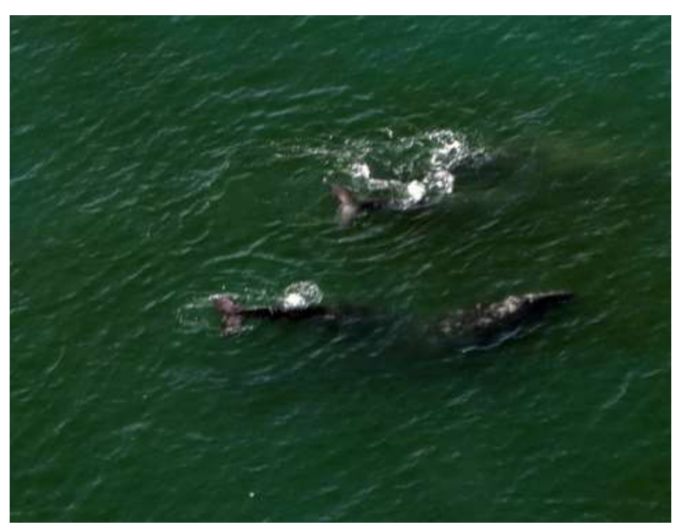
Bim's pic: looking down on whales near the beach