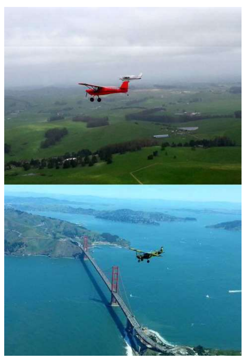
André over the GG (this plus next three pics)