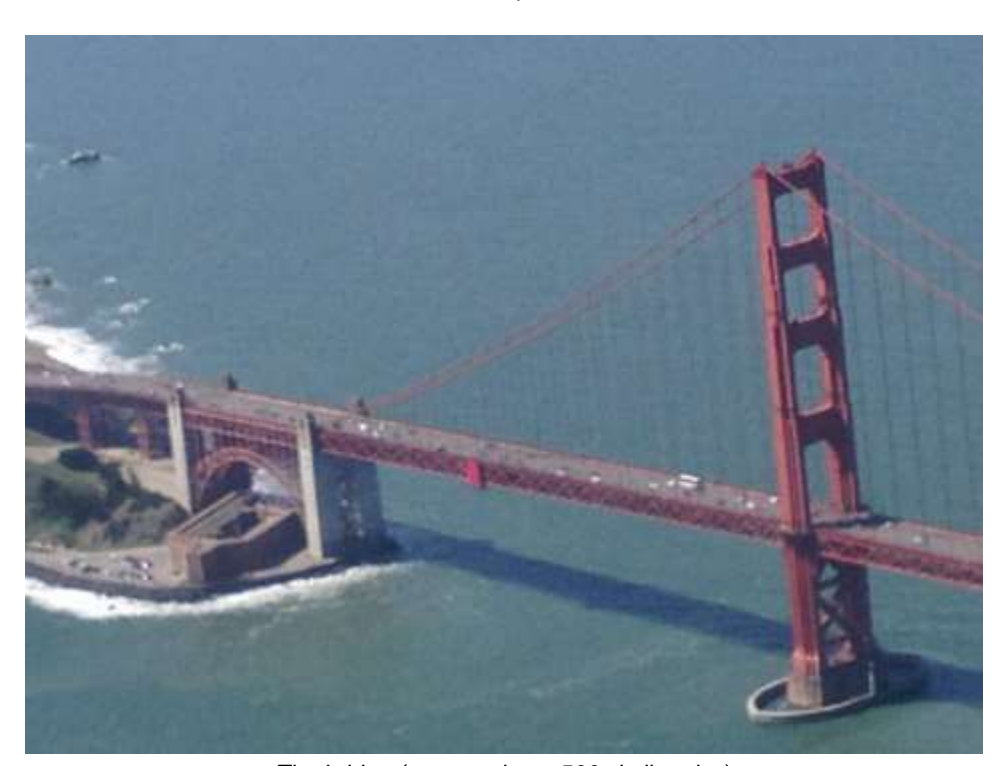
The bridge (we must have 500 similar pics)