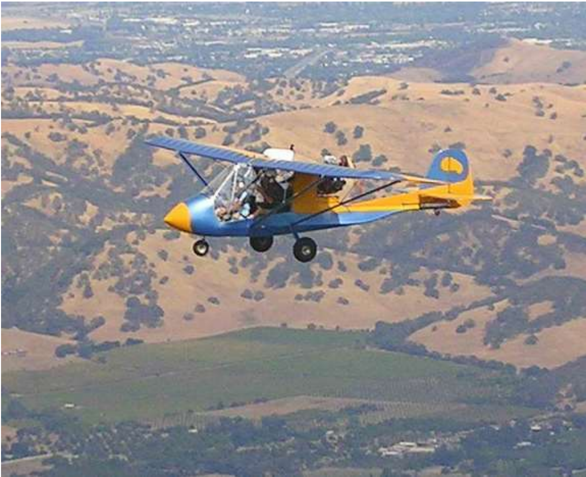
Les's Challenger North of Napa