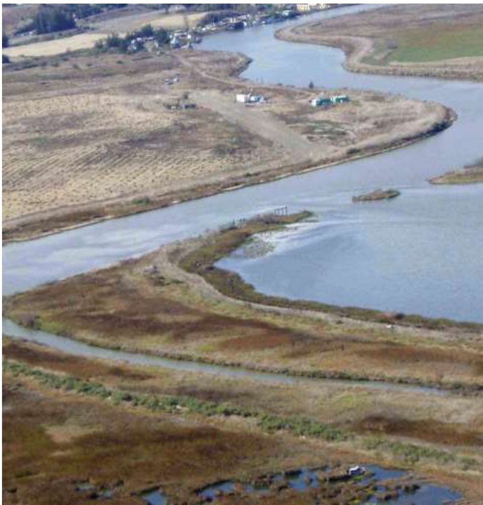
LUF Field on left base leg