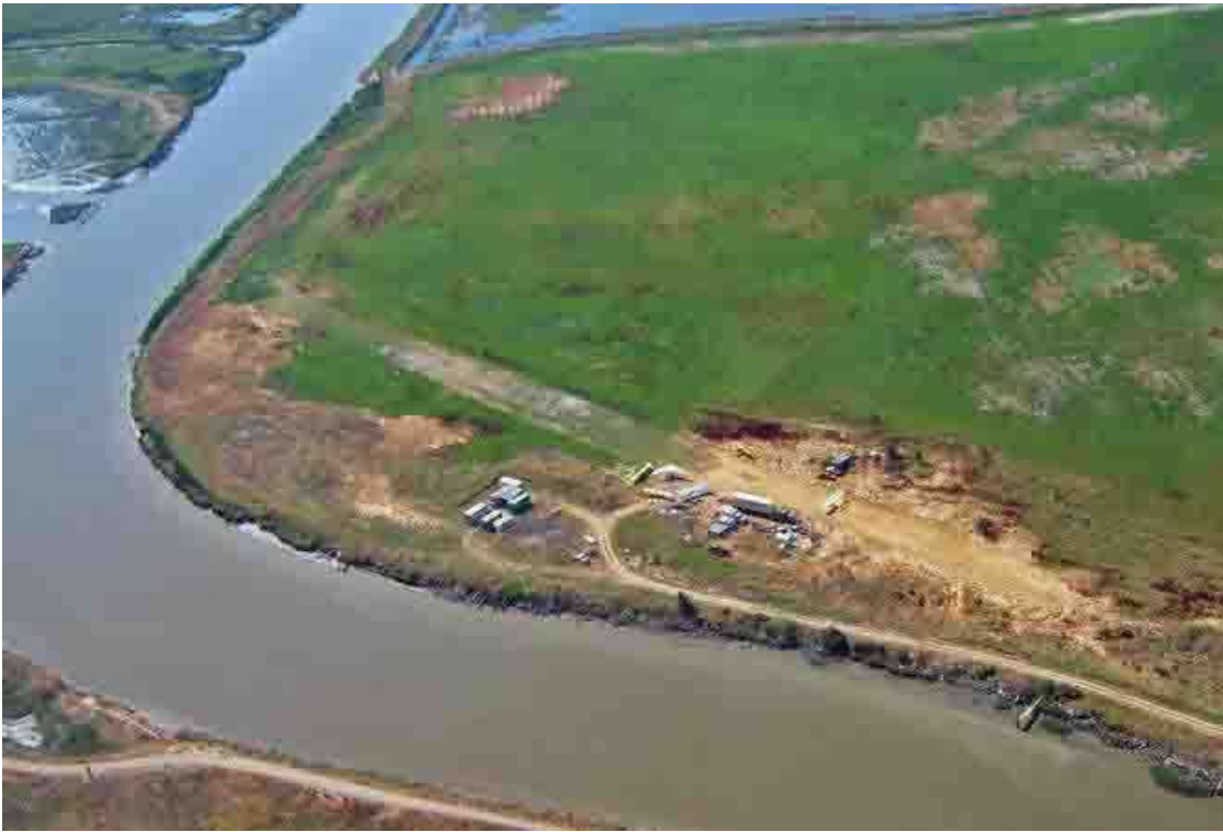
Looking down at LUF Field with Bim on the runway