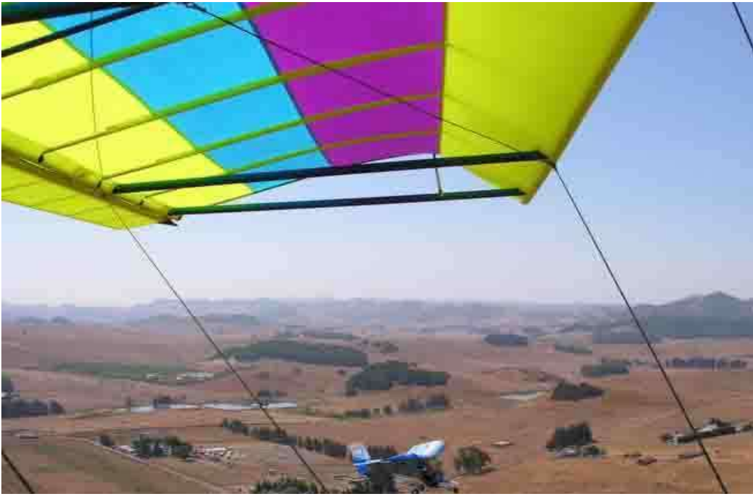
Lynn flying next to Bim near 2-Roc