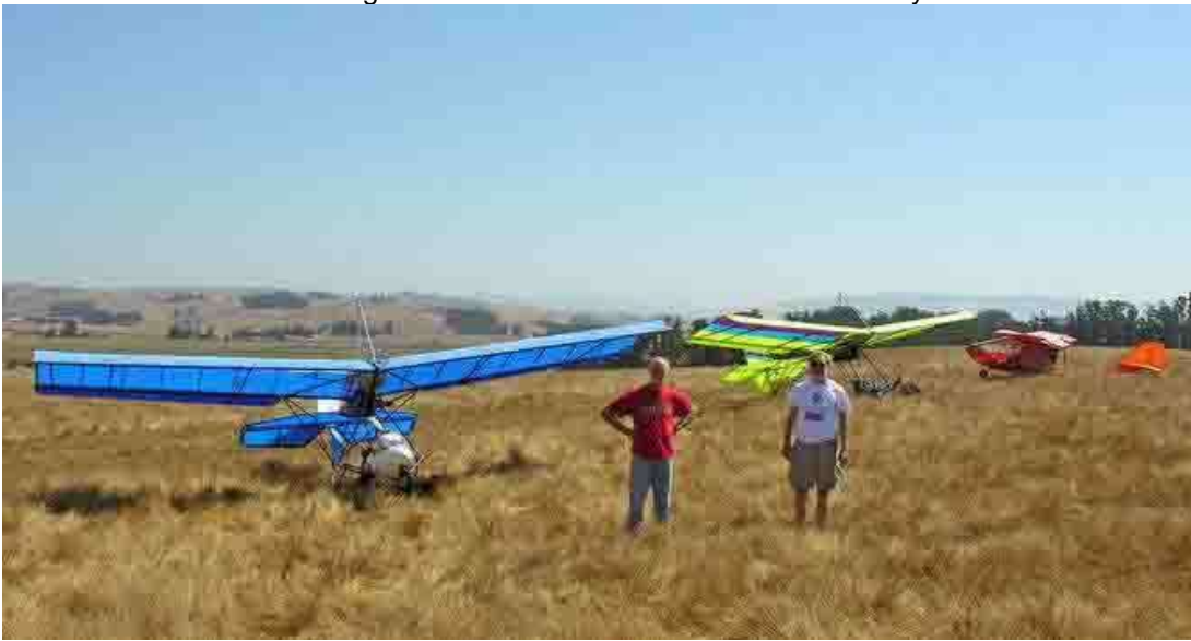
At 2-Rock after Bim finally had enough courage to land.