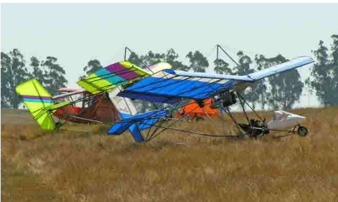
Resting in the grass at LUF Field