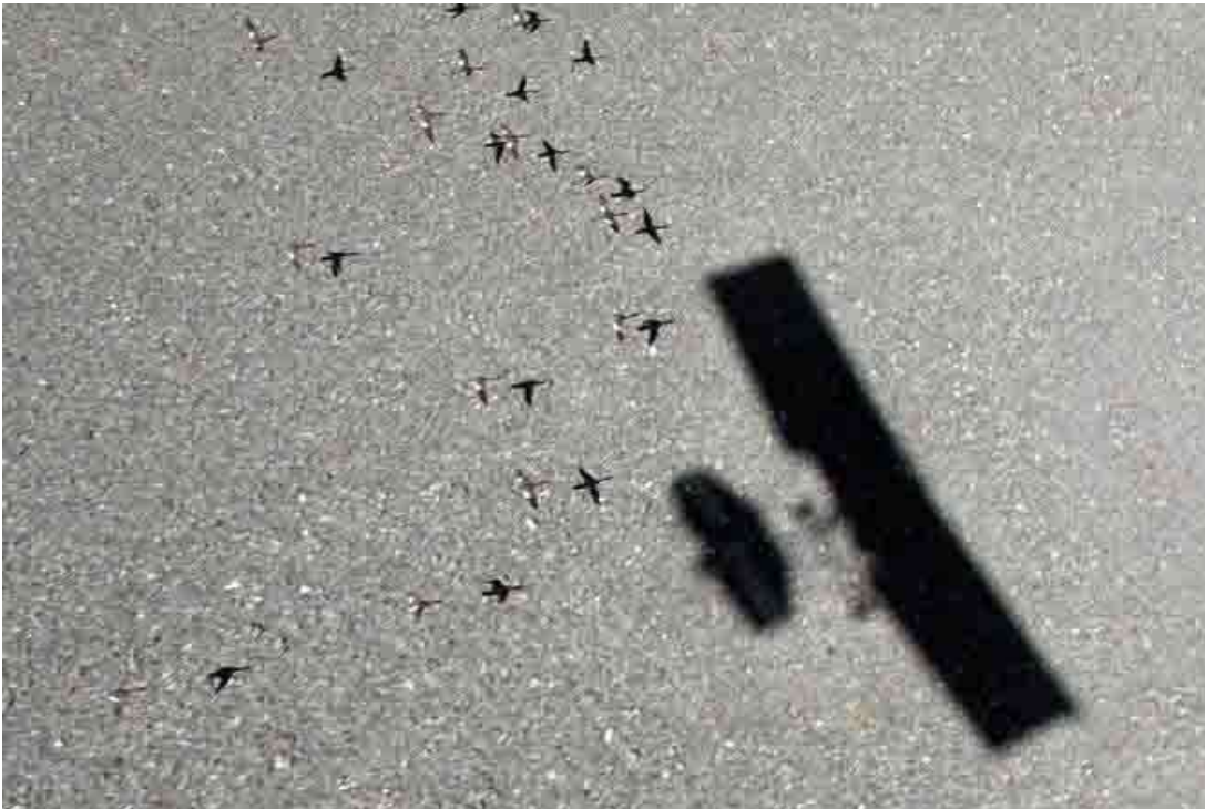
Bim for the birds (His shadow with the birds over the Russian River)

Bim found this on the Web: The clouds are called Mammatus clouds. They do not precede a tornado, or foretell a storm, but are formed when the air is already saturated with rain droplets and/or ice crystals and begins to sink. The worst of the storm is usually over when these kinds of clouds are seen. They are quite rare, but really beautiful.