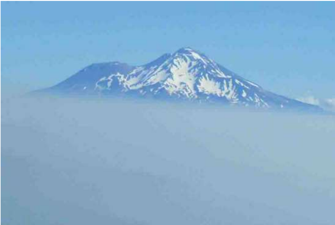
Mt Shasta (is Andre flying IFR?)