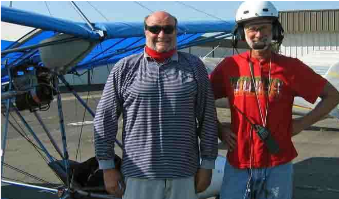
The fearless flyers on their longest excursion