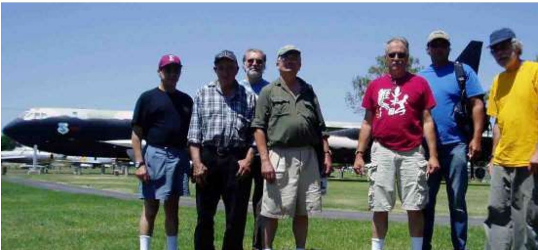
At Castle we toured the outdoor museum that housed most of the bombers and many fighters and transports in the US arsenal from between 1940 and 1990.