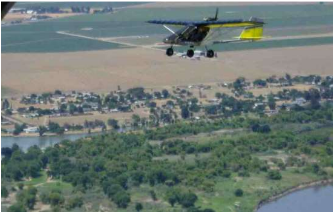
Harry flying south of Byron on the way to Castle