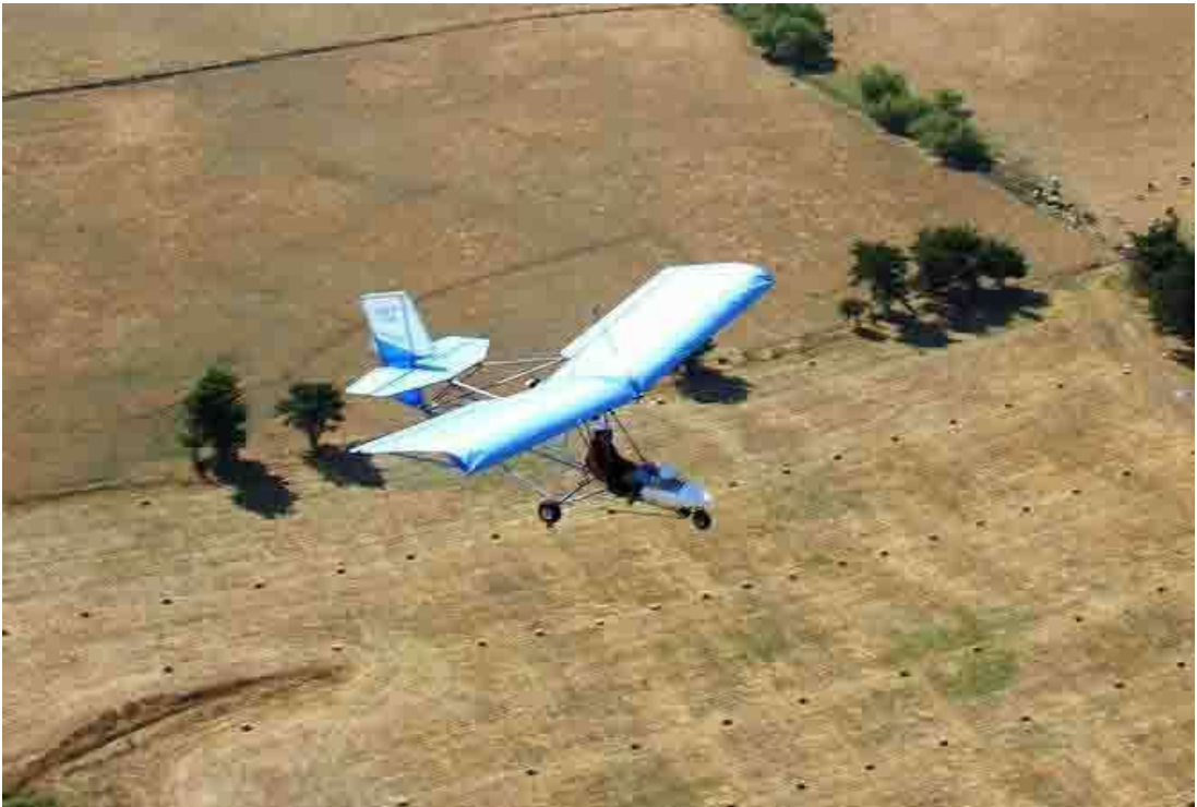
Lynn, too close to Bim