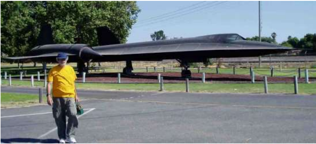
One of the 12 SR71 Blackbirds in this world. Les is blocking the view.