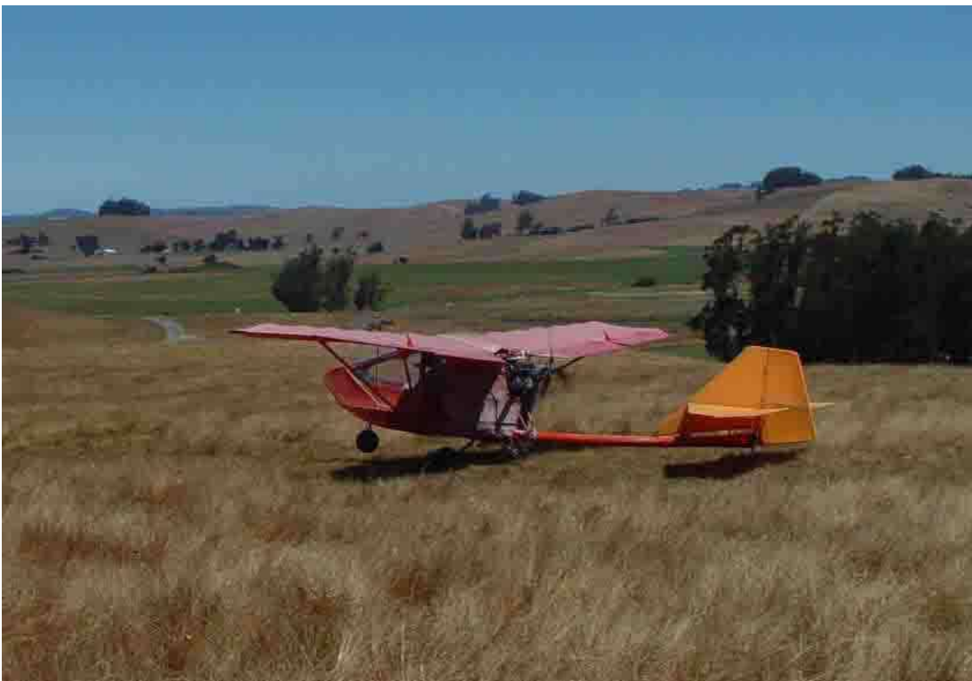
Also at 2-Rock by Charlie; Mark's plane out to pasture with the cows