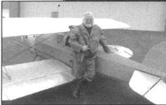
He built this miniture “Great Lakes” from scratch!