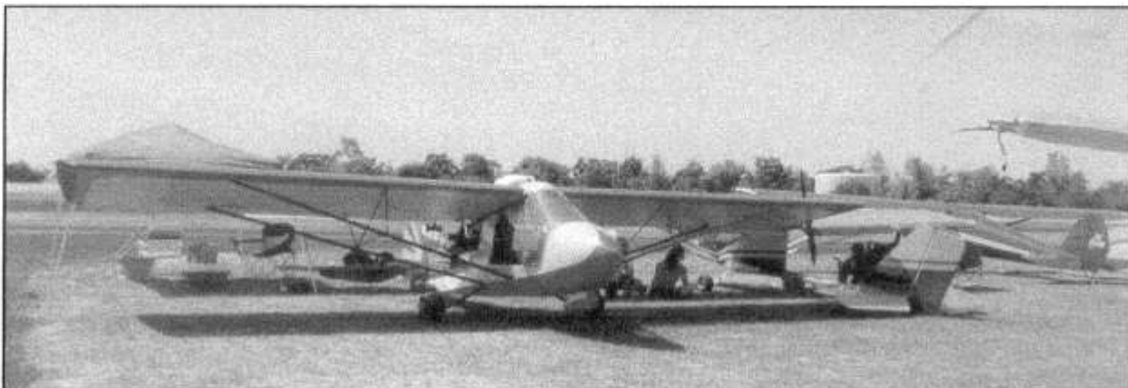
A challenger and a CGS Hawk back to back at the Watts - Woodland fly in.

This Nighthawk helio-copter was run mostly on hydraulics!