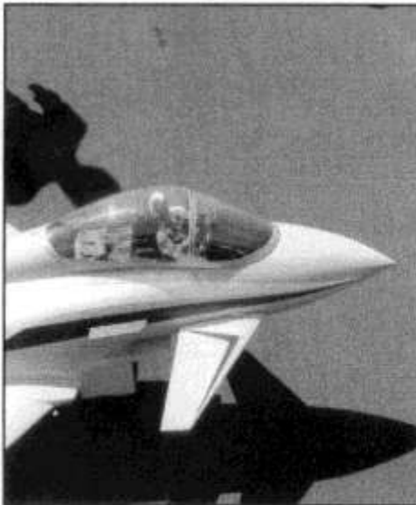
Close up of the 5' Radio Controlled jet