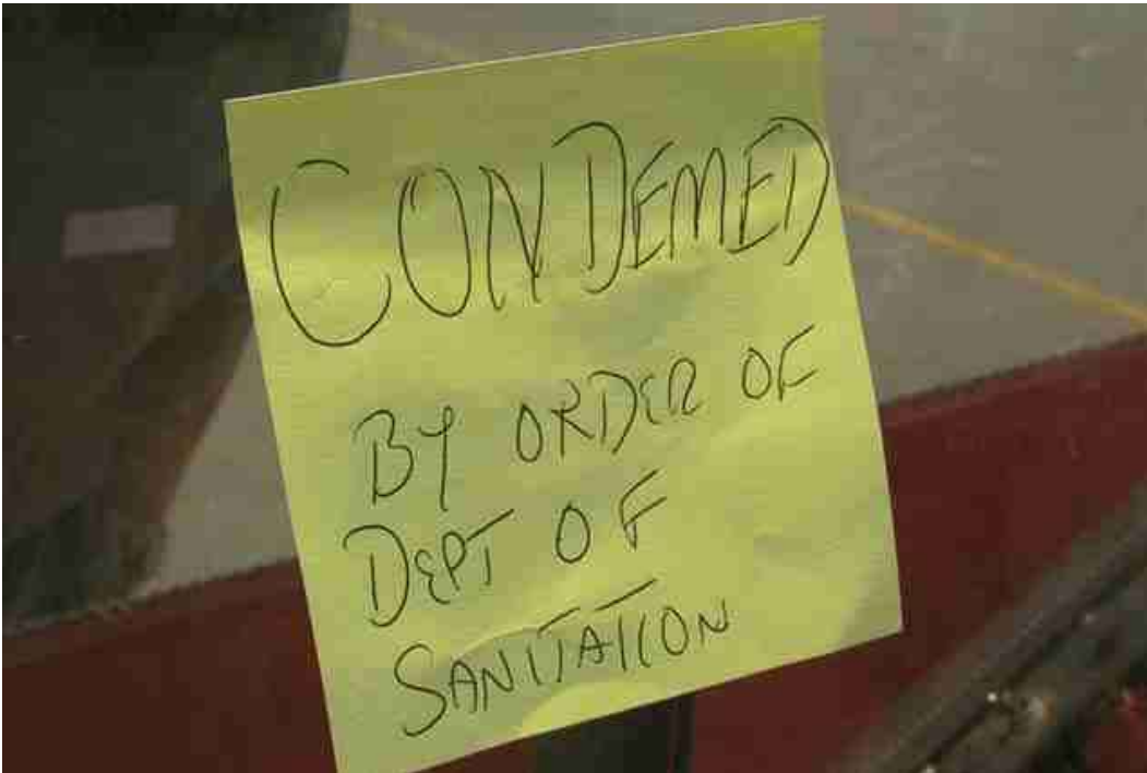
Guess whose plane?