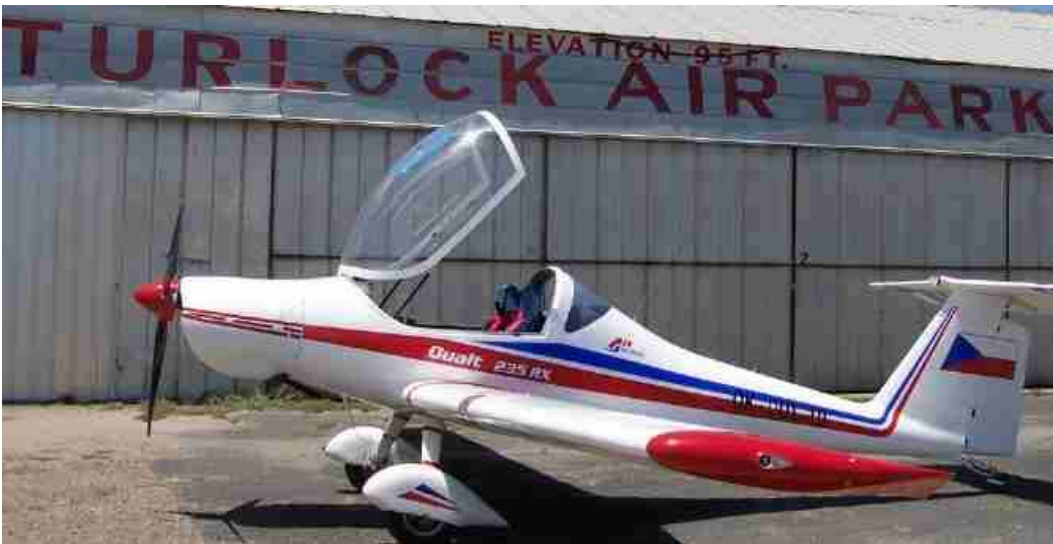
Proof positive that Paul can really land on a short runway.