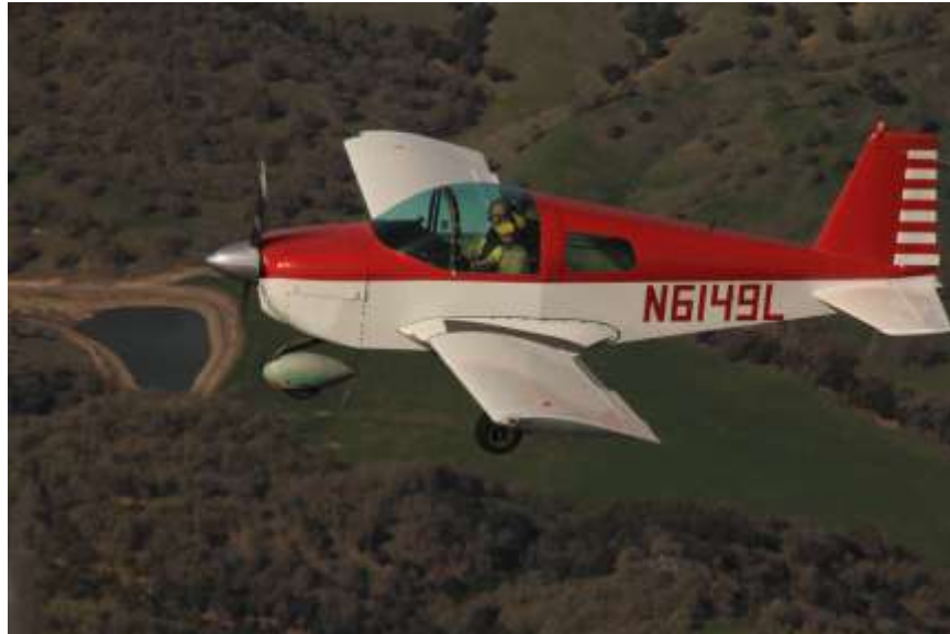
Luke, taken by Yarik from Les's Zenith 701 (Luke had trouble staying at the Zenith's speed)