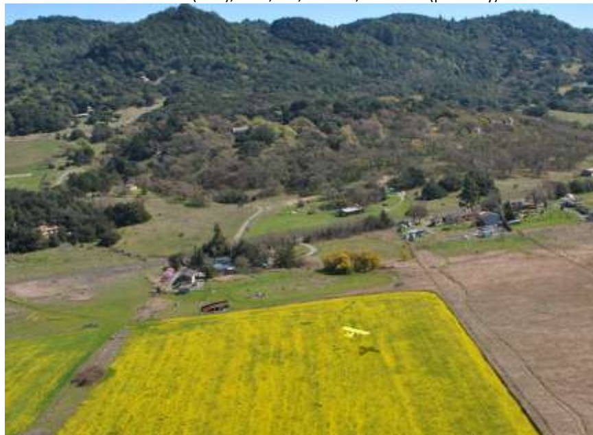
Who said mark can't cut the mustard anymore??!!