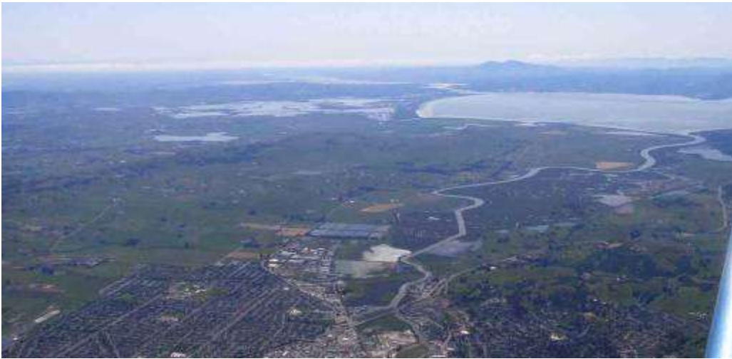
Les at 9500' going to 10,000' over Liberty Field looking SE. (Petaluma AP bottom left)