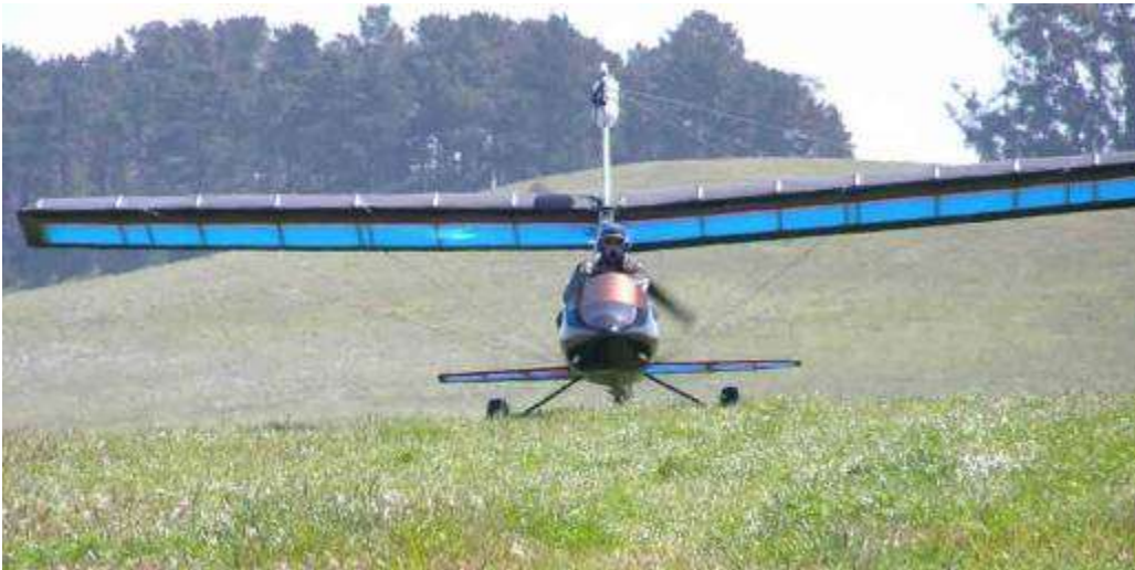
Charlie touching down at 2-Rock field