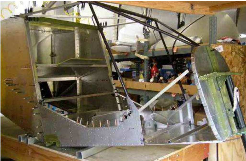
Les's garage filled with his 701 'project" (note wings hanging behind fuselage.