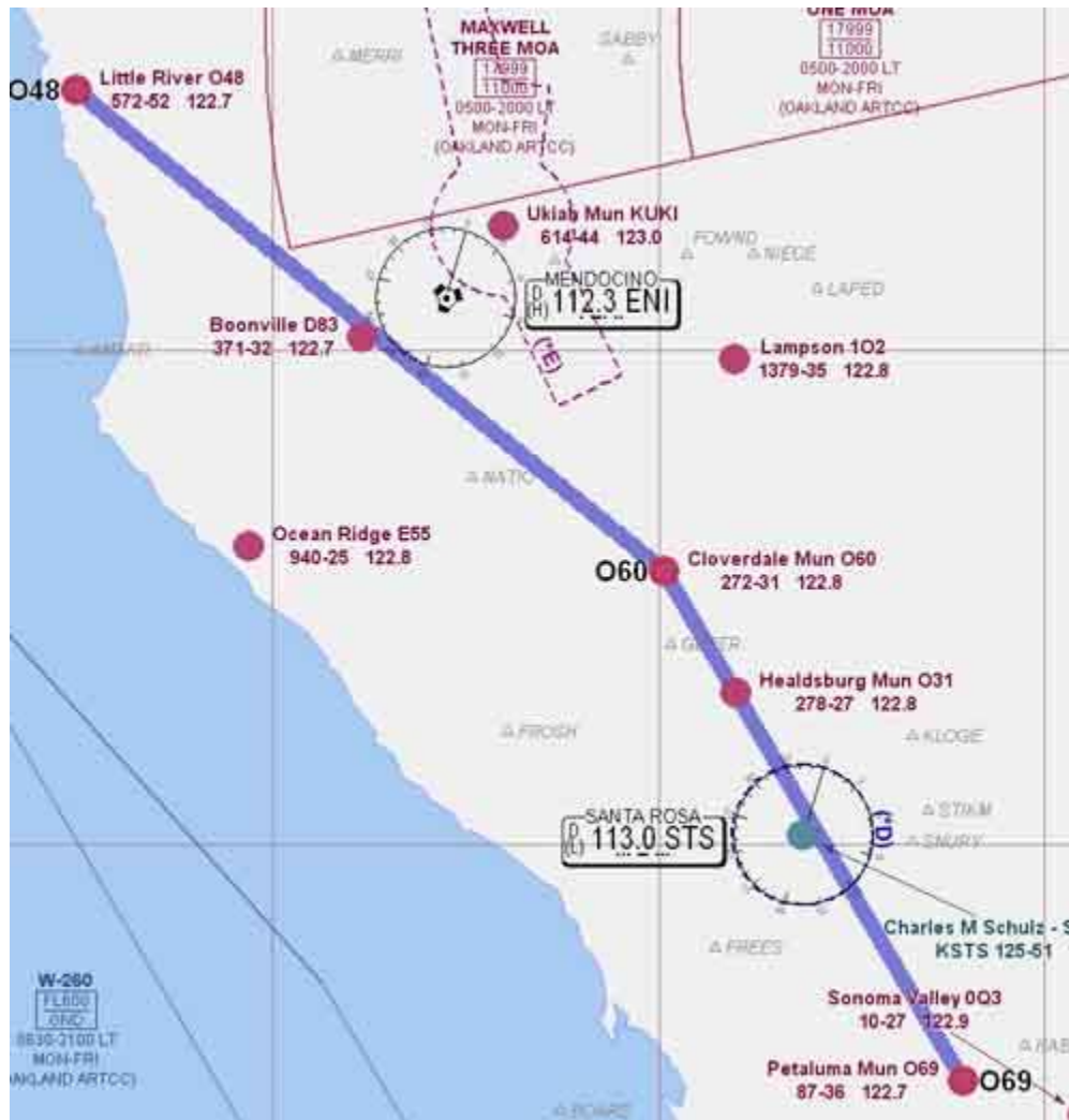
The 95 Mile flight out of Petaluma

At Little River we will be able to get fuel and take a cab into the historic Mendocino for lunch. We plan to leave Little River at 1:00PM so that we will be back in Petaluma well before our 4:30-PM monthly meeting.