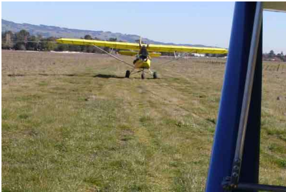
Mark landing back in history at Liberty Field before being shooed away for lack of N-numbers.