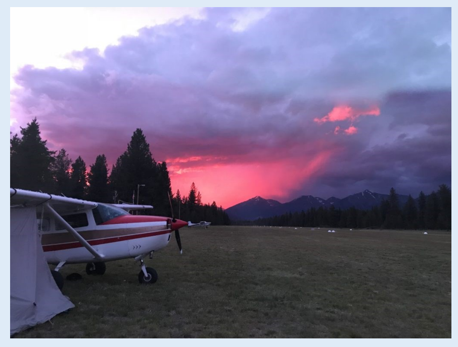
COME AND LEARN ALL ABOUT THEM MARCH 8, 7:30 PM