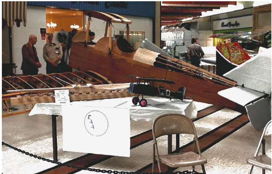
Chuck Garrett's SE-5A

The local EAA chapter, No. 145, has 75 members and several of them will be at the show to answer questions about the club and talk about their love of flying and building aircraft. Club members are involved in all facets of sport flying - antiques, gliders, ultralights, racers, vintage craft, aerobatics, warbirds, classics and factory-built airplanes.