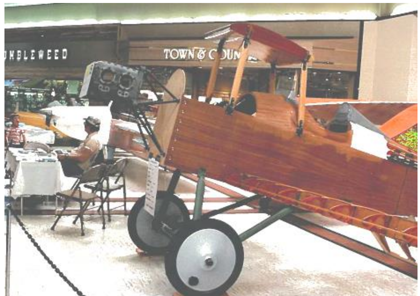
Chuck Garrett - SE5 replica

These photos were obtained from Ron Fritz' photo album. Thanks to Ron for documenting the chapters activities over the years.