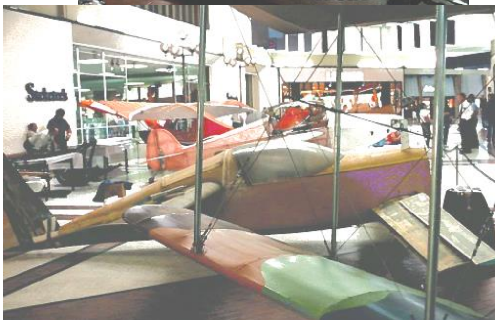
With a SPAD XIII wing in the foreground