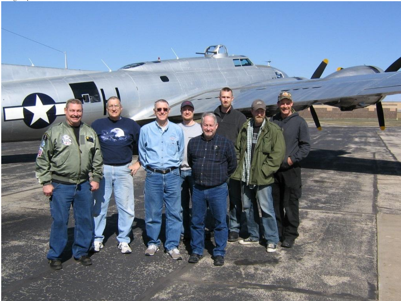
EAA Chapter 145 members with EAA's B-17 Aluminum Overcast at Oshkosh, April-2013