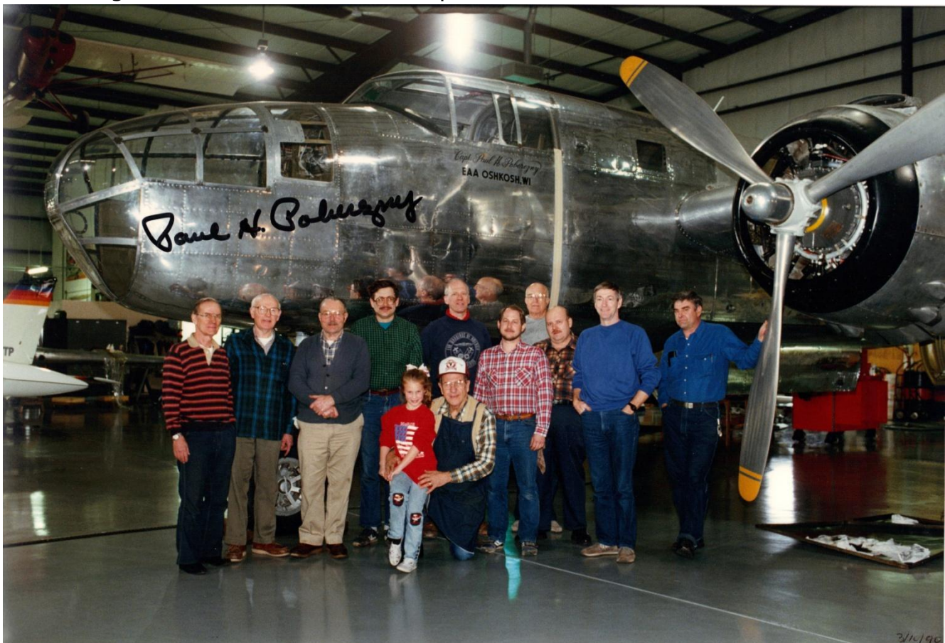
EAA Chapter 145 members with EAA founder Paul Poberezny in the Kermit Weeks Hangar, March 1990.