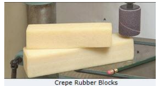
Crepe Rubber Blocks

Editor: Crepe rubber also does an excellent job of cleaning up excess rubber cement or liquid frisket (watercolor masking material). You can also make your own version using clear Silicone 2 caulking. You have to make your own block by applying about two-thirds of a tube spread thinly onto a sheet of wax paper or plastic. Let it dry for two days and cut into strips the length and width of the block required. Glue these strips together with the rest of the caulk and glue them to a paint stirrer, if you like, to make a useful handle! Leave to dry another two days, and voila, you have a nice cleaner-upper that should last a long time and save you money on sanding belts. If you have any silicone caulking that's going to expire without being used, this is a great use for it. In fact, if you have any that's already been hardening for a few years, you might just want to cut the tube open and see what'cha got!