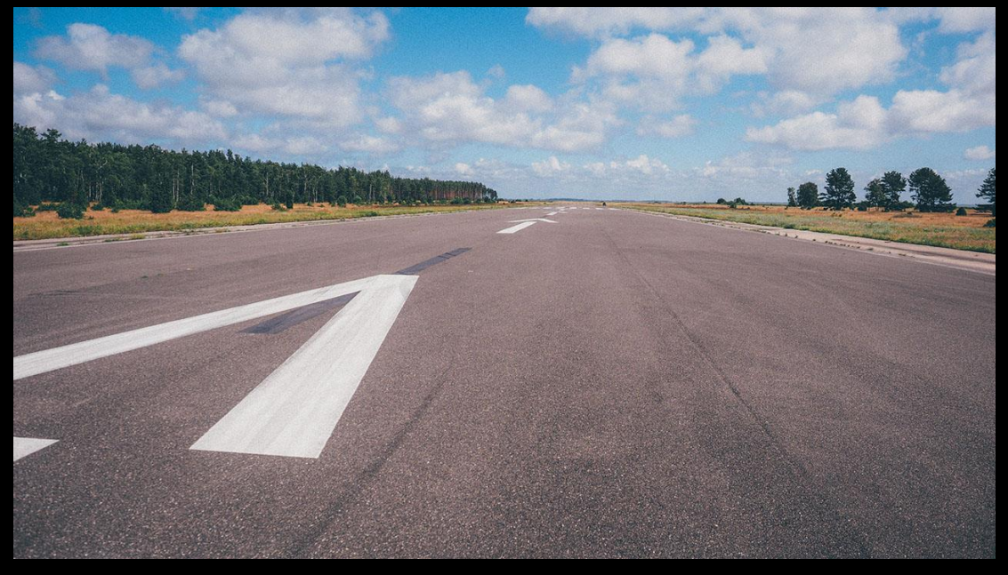
Pandemic And An Uprising: How Our Flying Has Changed... And How It Hasn't