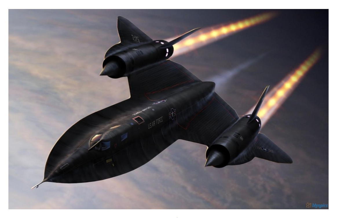
SR 71 Fly By