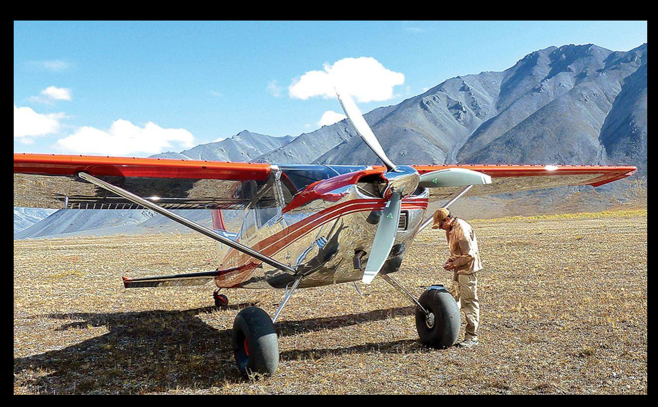
Proposed AD Affects Roughly 6,600 Cessna Aircraft