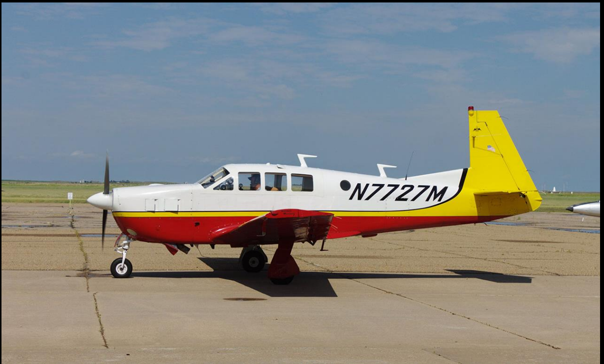
Mooney M22 Mustang: The First Pressurized Piston Single