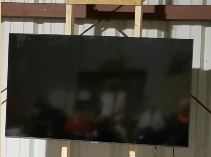
New Monitor for Video Displays