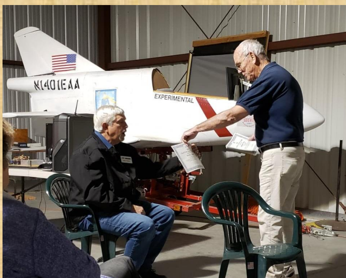
Annual Chapter Certificate Presentation