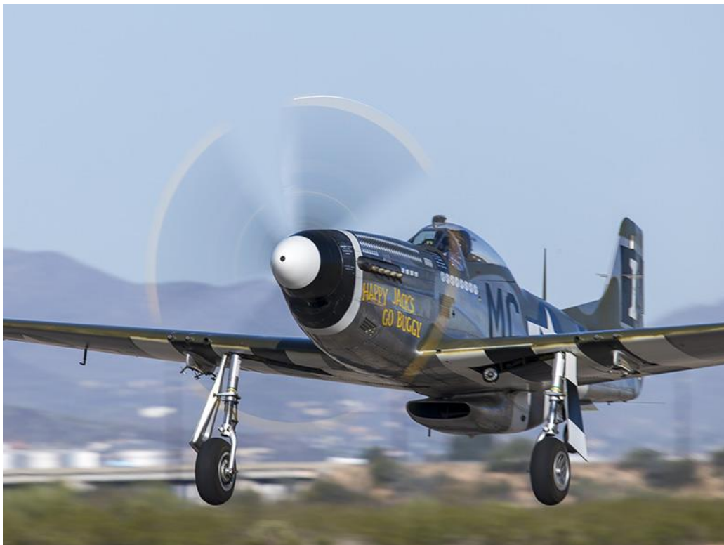
WARBIRD STORIES: HAPPY JACK'S GO BUGGY P-51 MUSTANG