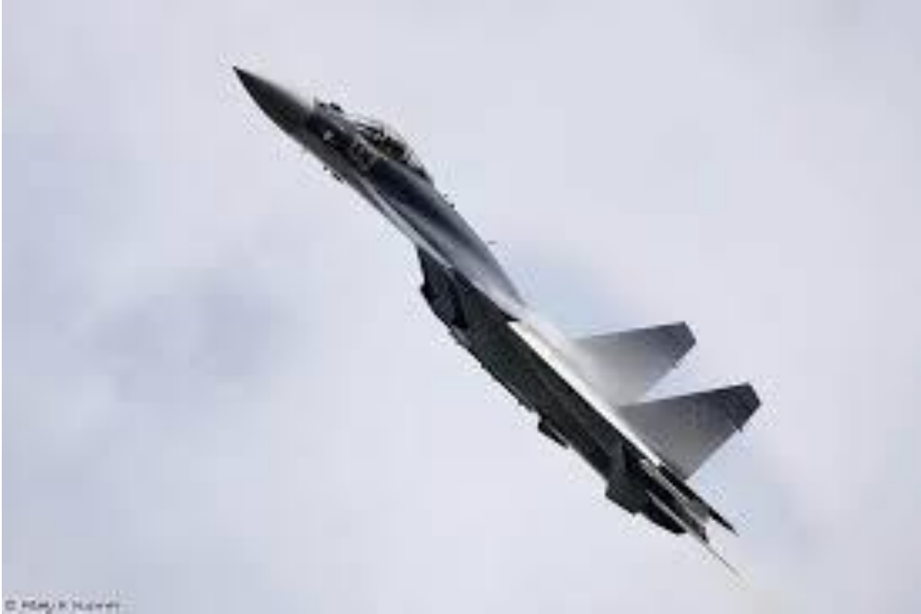
Sukhoi Su-35 at Airshow Moscow