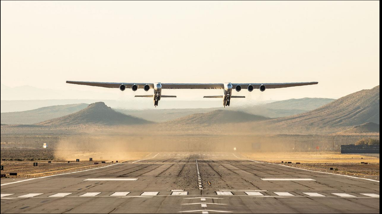
Biggest Plane Flies Again!