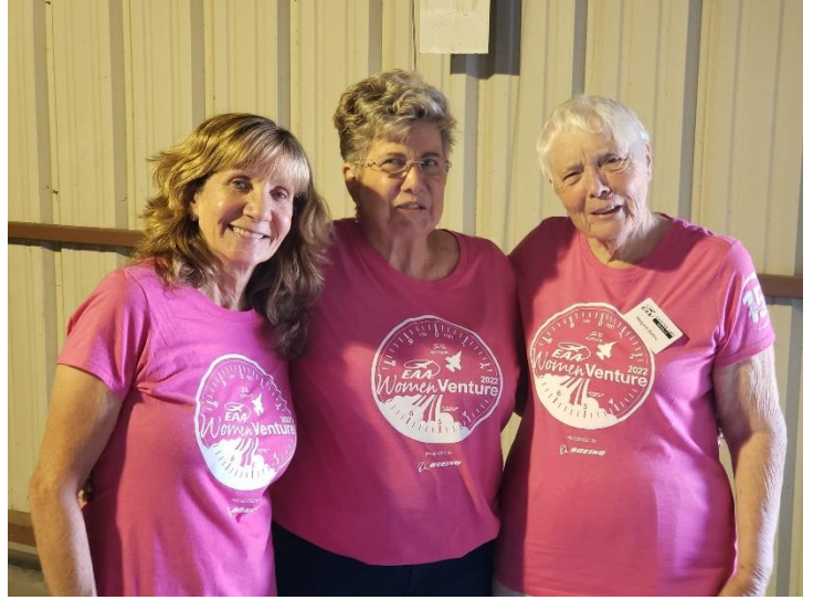
Our Oshkosh Air Venture Ladies 2022