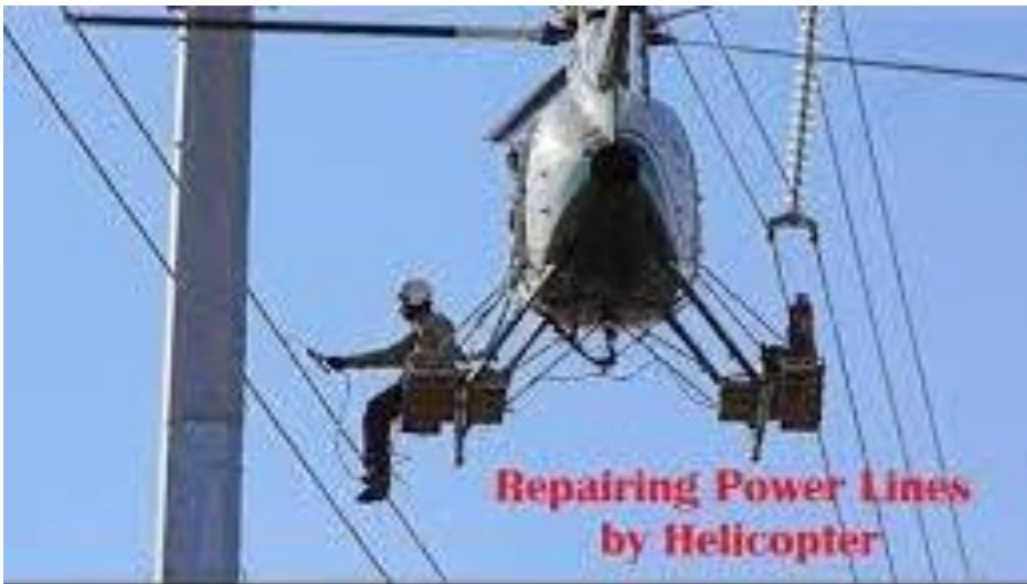
HELO PILOT REPAIRS

Our Blue Angels FA-18 Hornet has arrived! Castle Air Museum