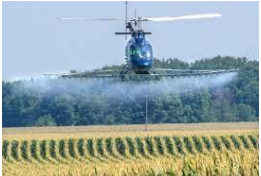
Crop Dusting Helicopter