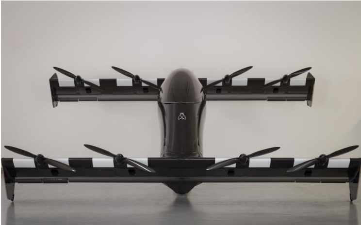
Black Fly V3