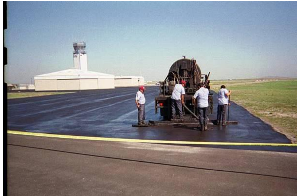
Ramp finally gets sealed