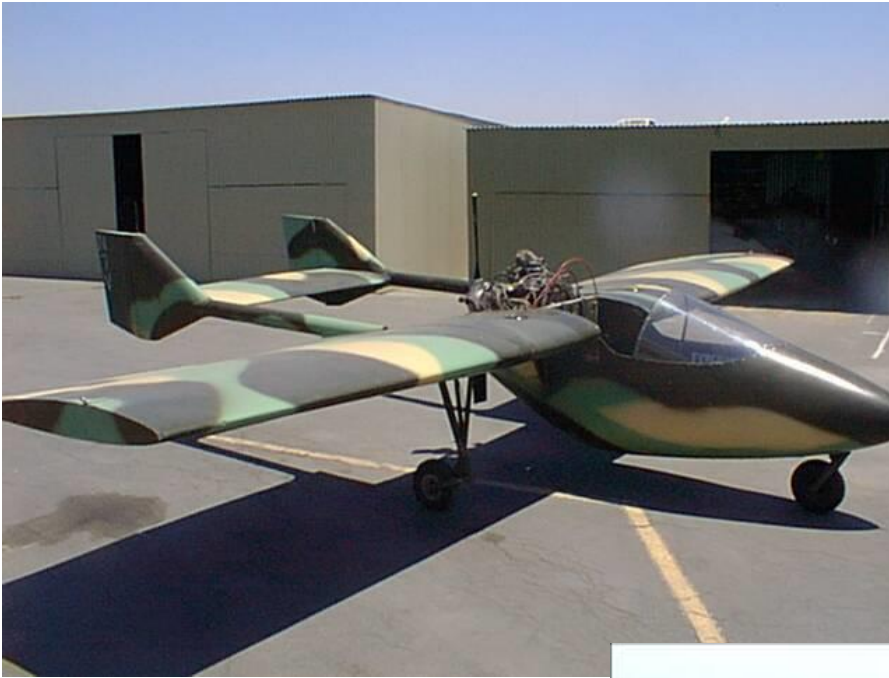
Ryan's Sadler Vampire with Volkswagon engine