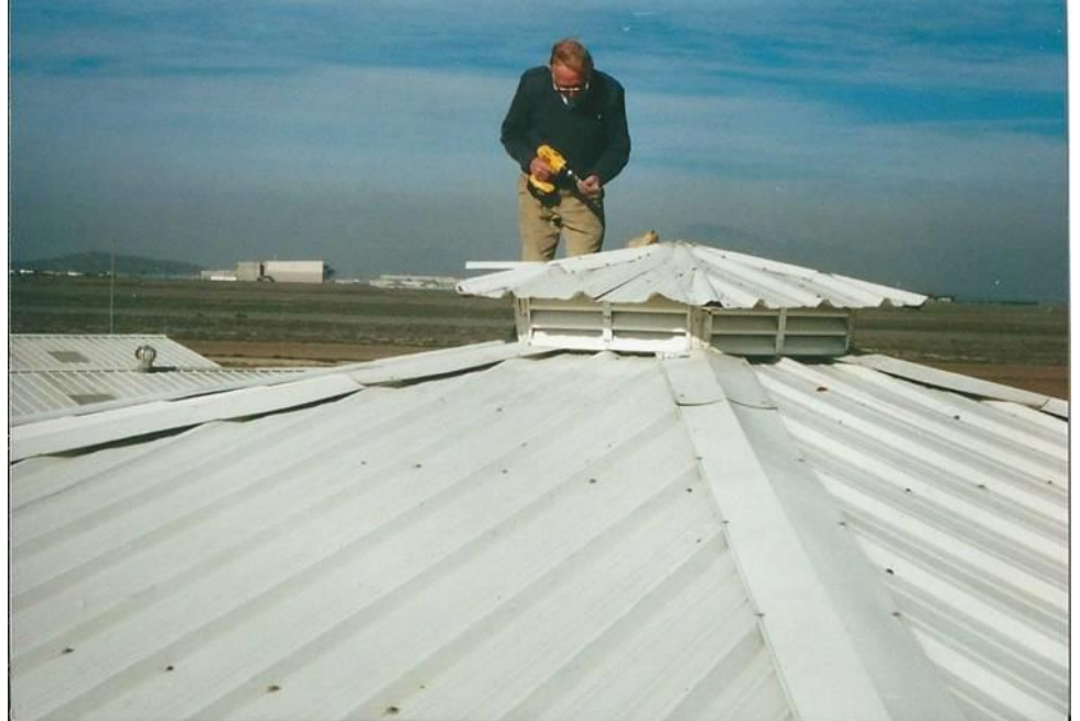
Dennis Cullum on Roof Repairing Cupola