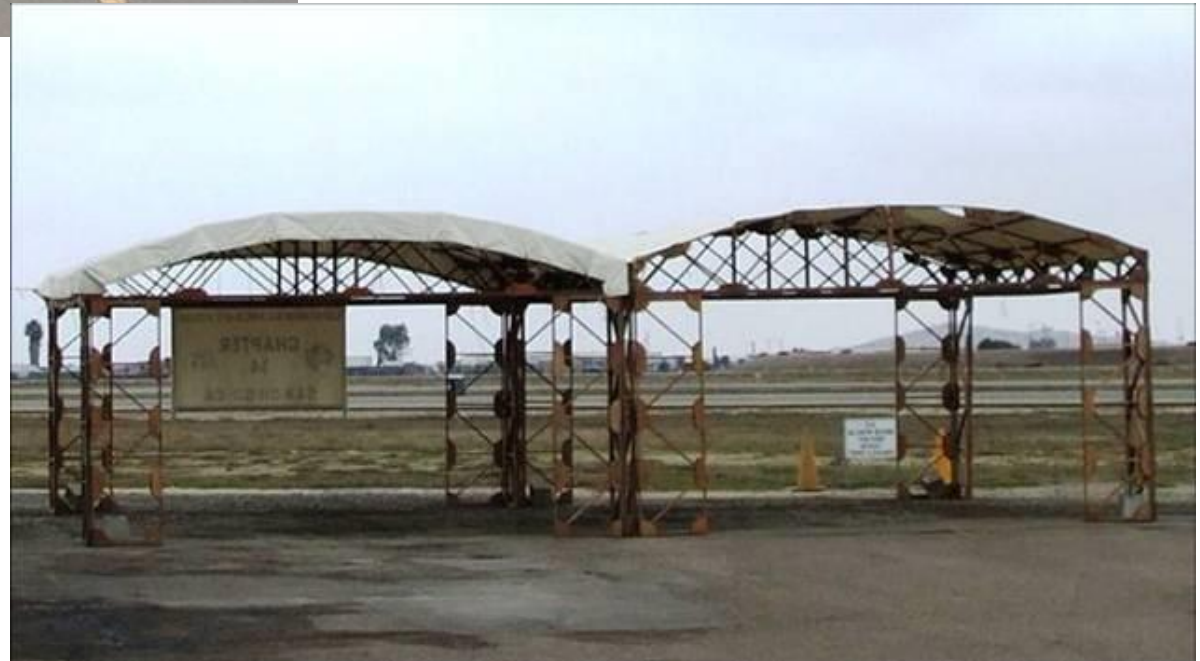
WWI replica hangars build by Chapter