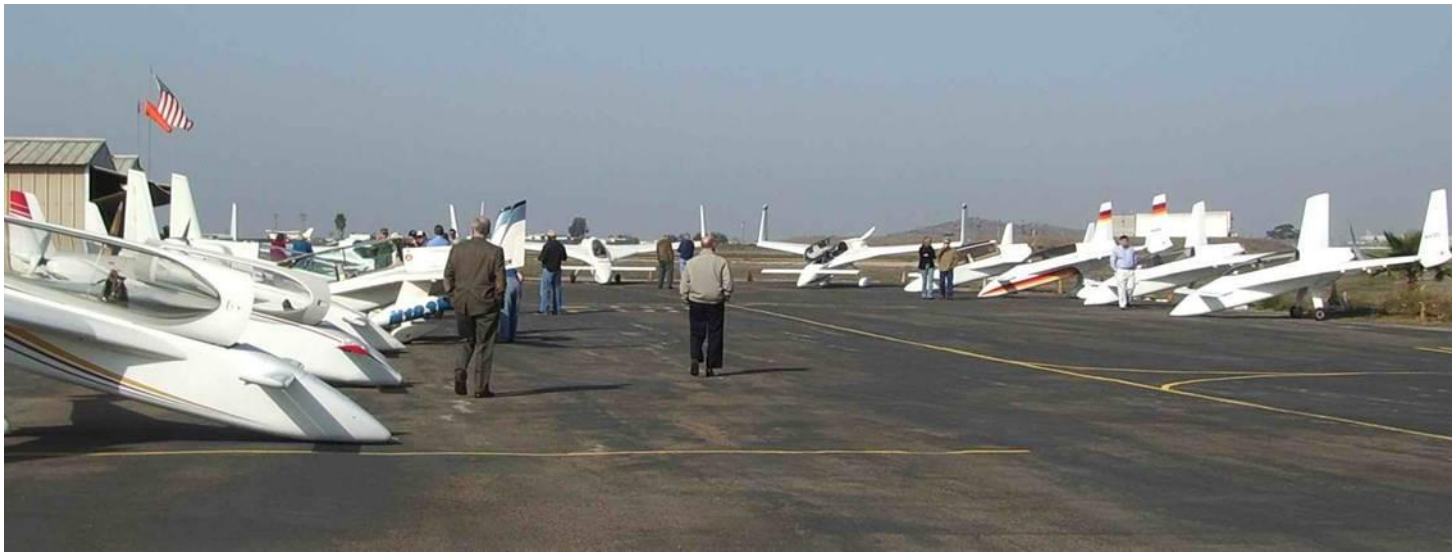
Long-EZ's fill ramp