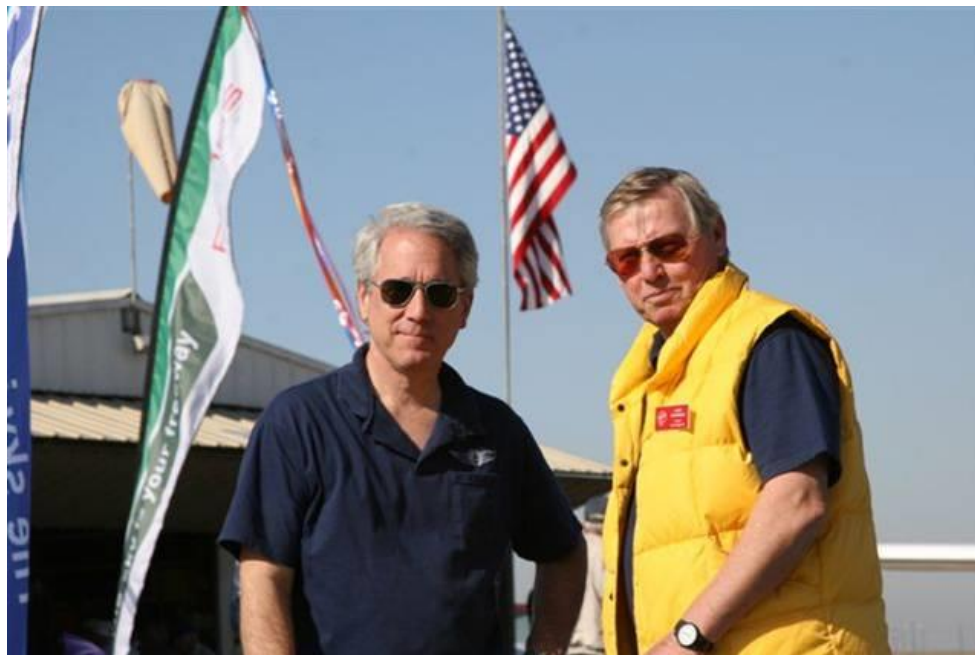
EAA Sport Pilot Seminar