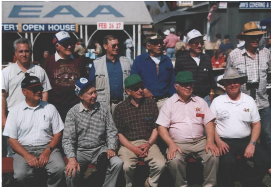
Chapter 14 at Flabob Open House