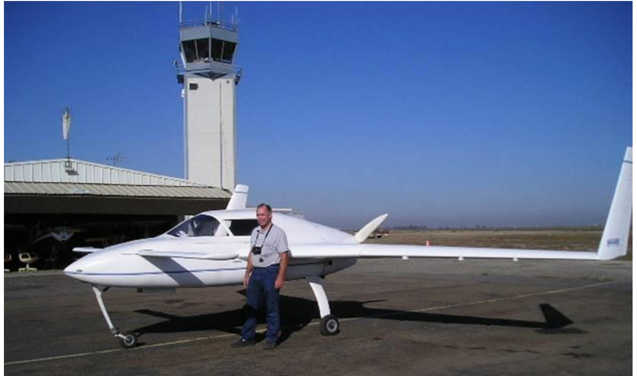
Ryan's Mazda- powered E-Racer