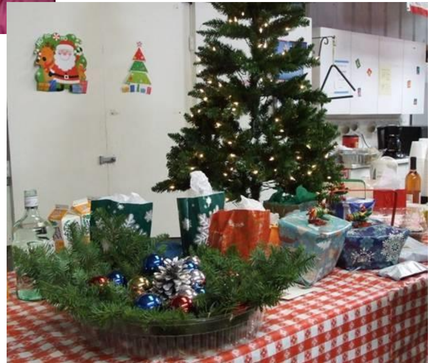
Holiday Awards Banquet in Hangar 1