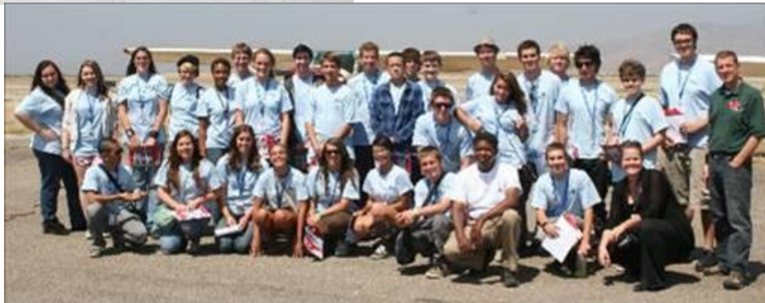
ACE YE event