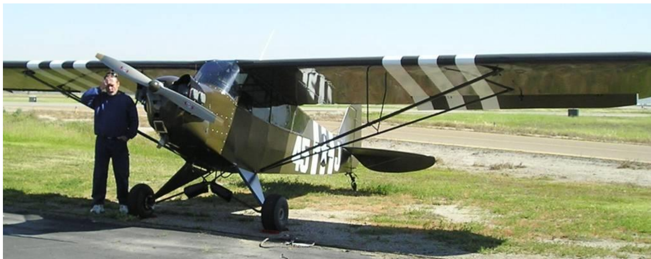
Craig Kennedy's Piper 4LS Warbird