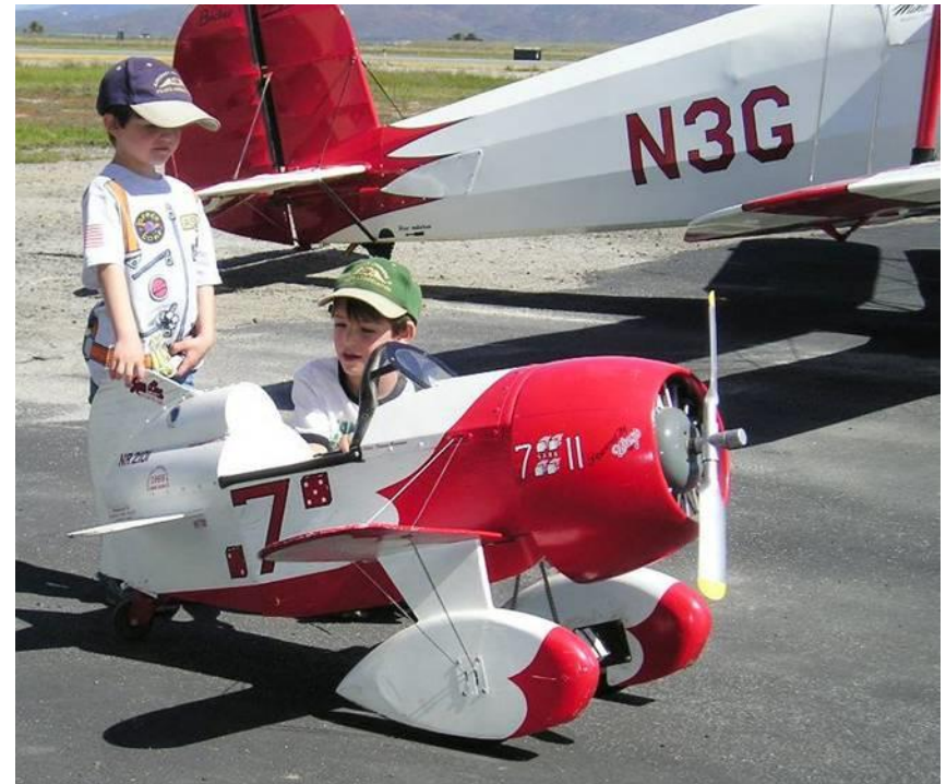
Pilots in training