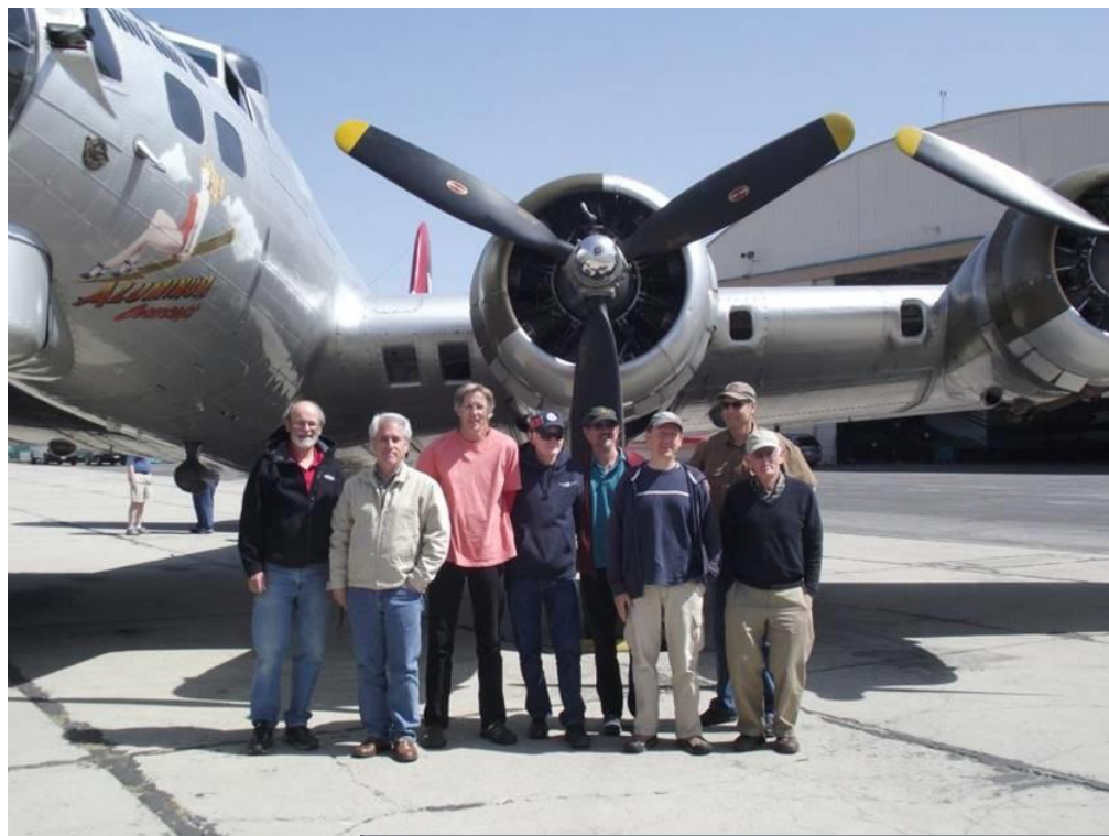
EAA 14 Members help out with B-17 visit