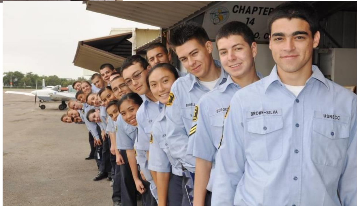
Young Eagles Group

Rainbow Aviation Services conducting class in Hangar 3 for designation as a Light Sport Aircraft Repairman