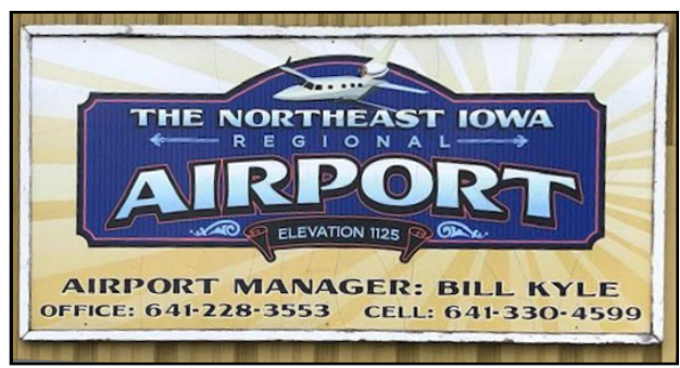
Charles City Flight Breakfast July 17