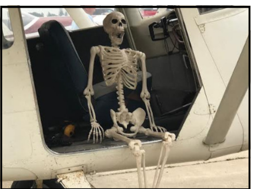
September 2 Flight Breakfast to Hampton