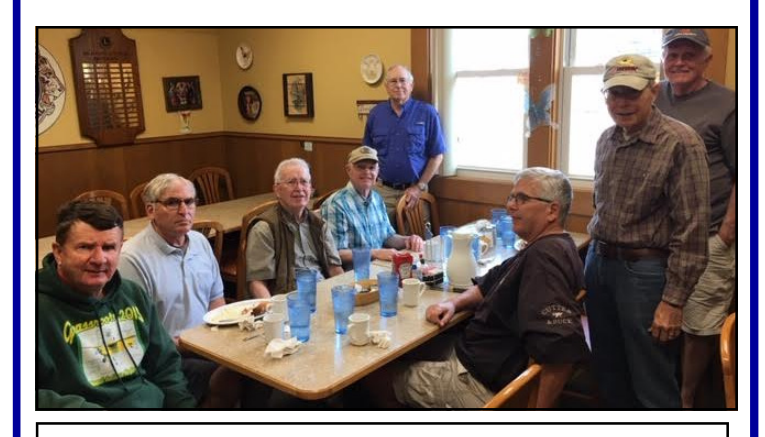
FOGZ (Flying Old Geezers) meet up at a restaurant in Belle Plain