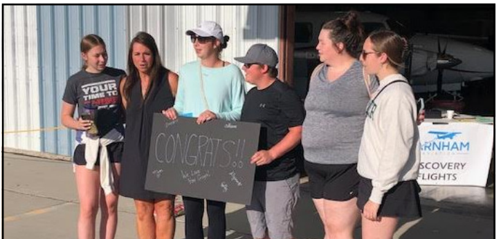
At the Boone Area Pilots' Association Fly-In breakfast on May 14, there was a successful marriage proposal during an airplane ride