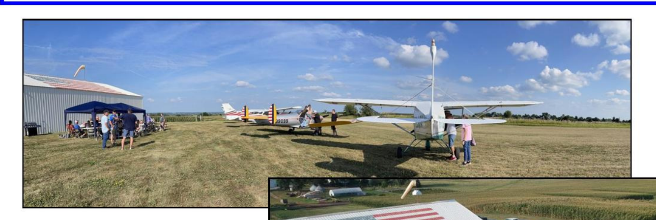
Assisting at the Historical Museum

August 5 Sweet corn feed at Stewarts' Field