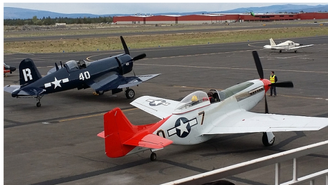
Visiting KBDN last week from Madras' Erickson Aircraft Collection