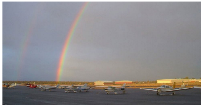
Colors over KBDN