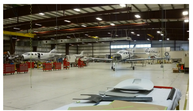
Four of the final seven Epic kitplanes – onward to certification!

We had a great turn out for the "Epic" tour. With all that they are trying to accomplish, they have their hands full so, it was an honor that we were given such a grand tour.