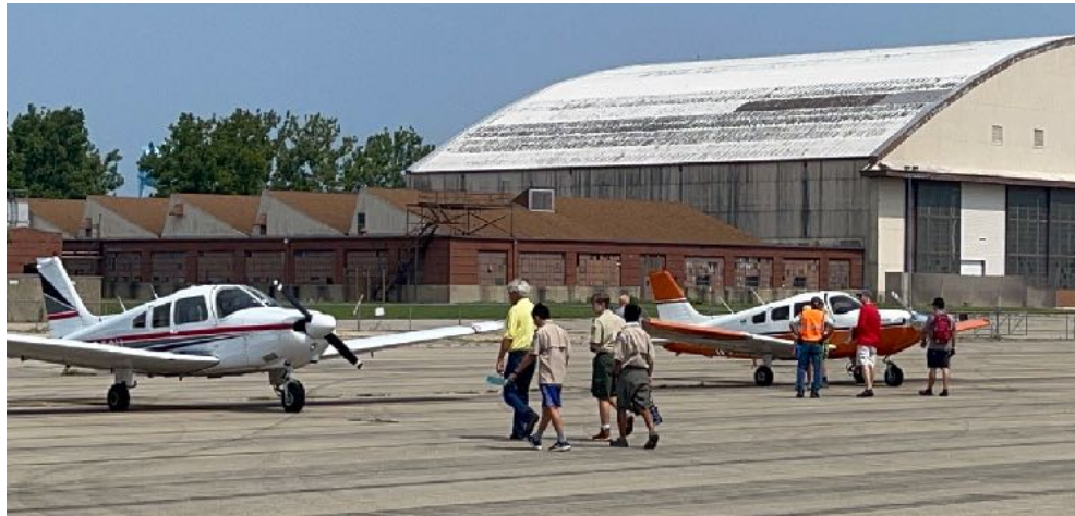
Young Eagles flights at the Boy Scout Jamboree at Rantoul