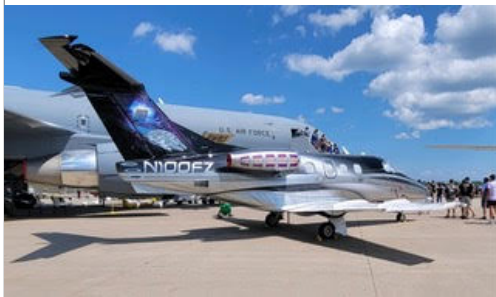
The Millennium Embraer Phenom 100 John Stahr's amazing artistic talents were on display at OshKosh 2022