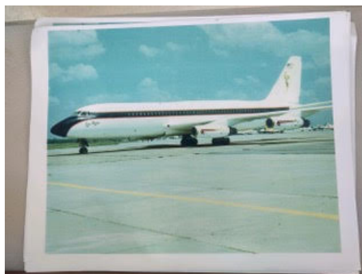
The "Lisa Marie", a Convair 880