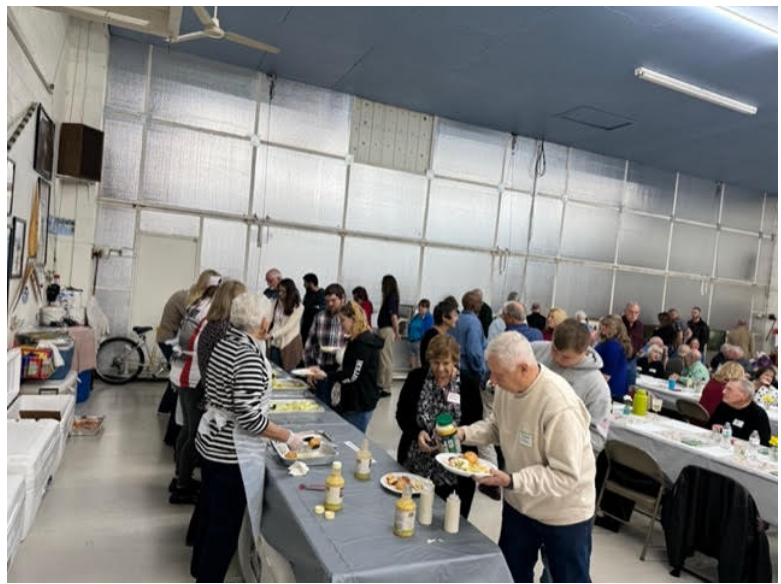
Time to eat!