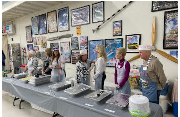
Our server team. . .