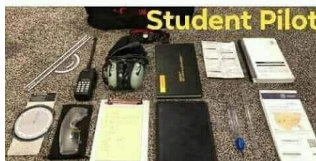
A student's flight bag vs. an instructor's bag: