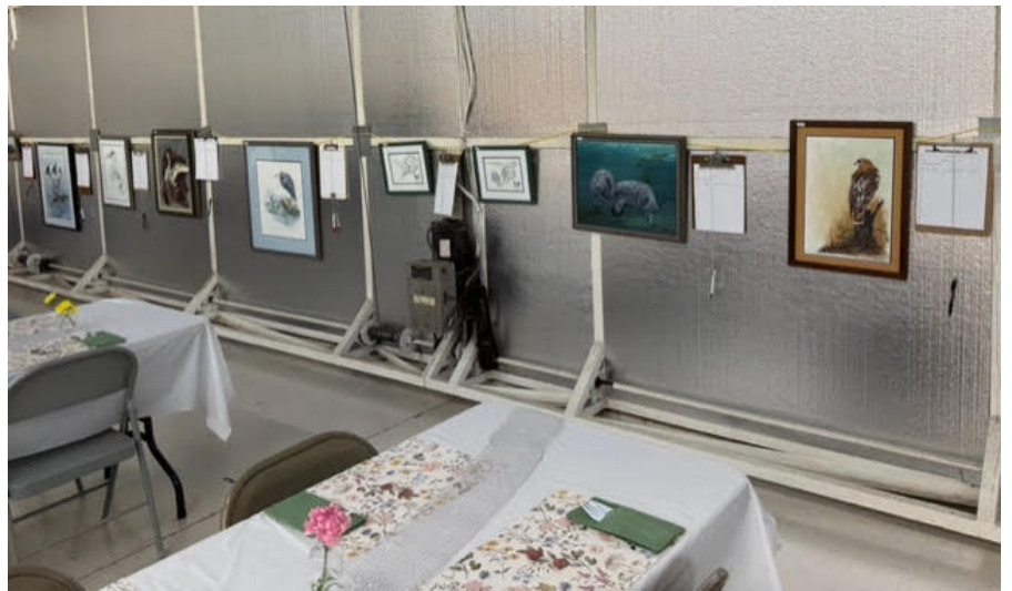
Silent Auction set up with Judy Brown's paintings .