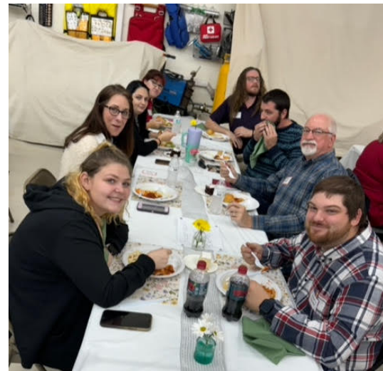
Our Friends of the Chapter, the Battery Boys team. . .