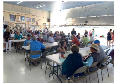
Pancake Breakfast 2023