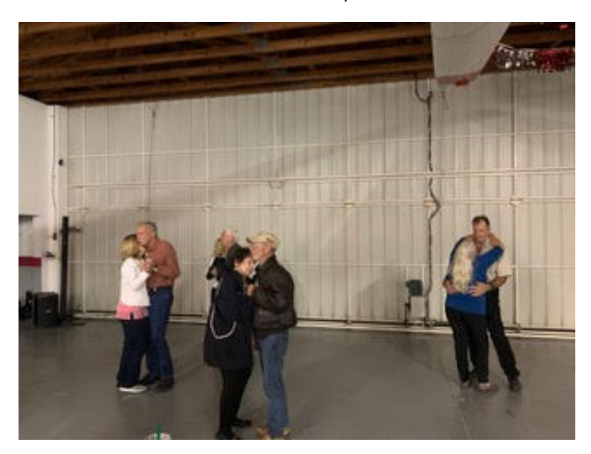
The Music and Dancing went on until about 8:45. Great times...